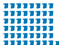
FY 2013 24,475 TONS

To date in FY 2016, residents recycled 26,166 tons (52,332,000 pounds) through the new recycling program.