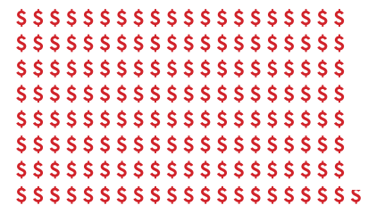
2010 - 2016 $16.8 MILLION

...the City has saved more than six times the dollars in avoided costs and received nearly five times more dollars in PNM rebates.