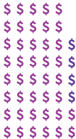
2010 - 2016 4.6 million