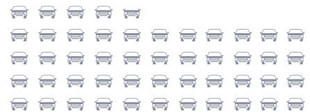
...or taking more than 2,464 cars off the road

CARBON FOOTPRINT CALCULATOR FROM http://www.epa.gov/energy-resources/calculator.html