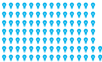
2010 - 2016 100 PROJECTS

...and implemented seven times the funding on energy efficiency projects...