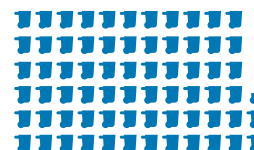
FY 2015 34,206 TONS