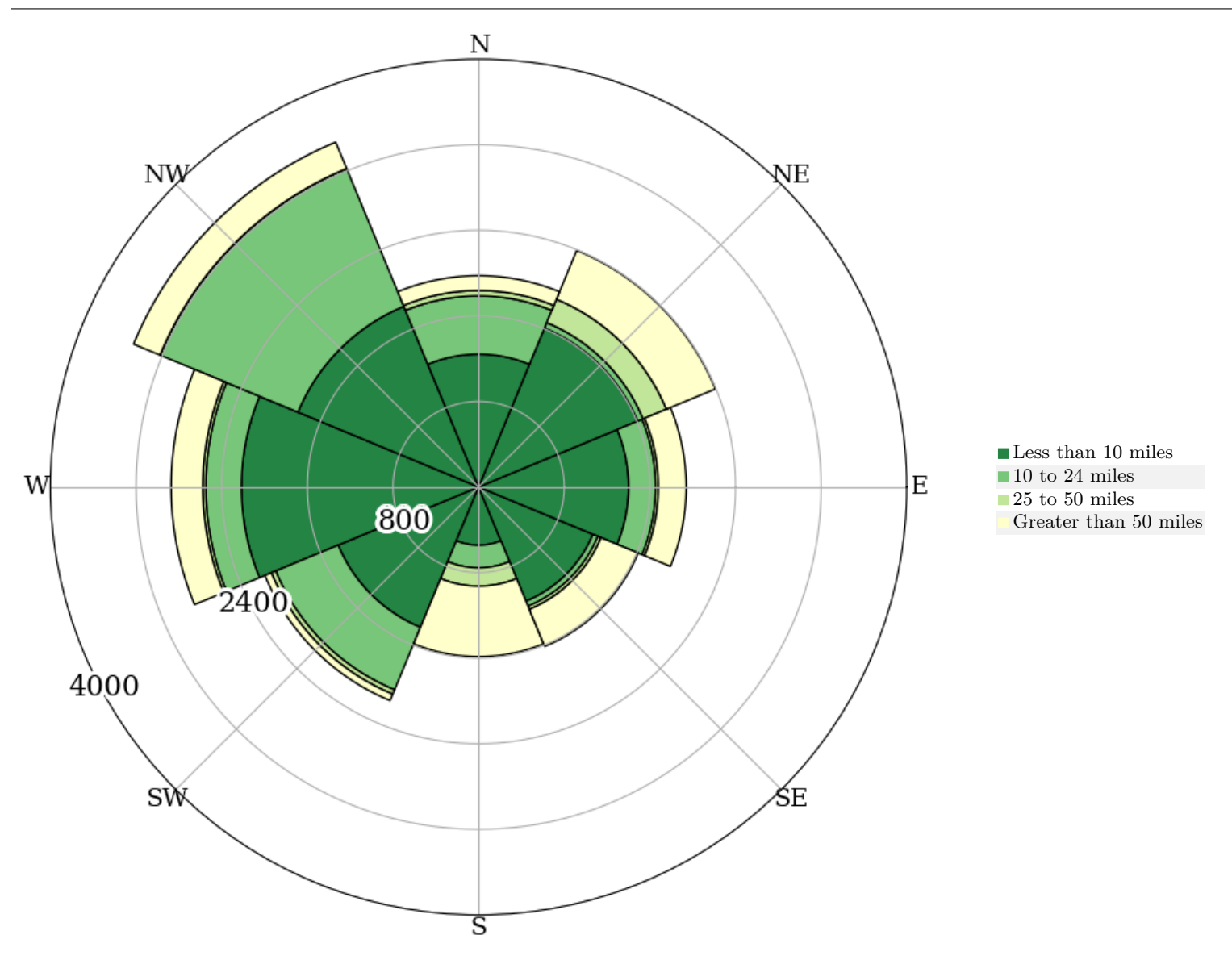
All Jobs for All Workers in 2019 Distance from Work Census Block to Home Census Block, Employed in Selection Area