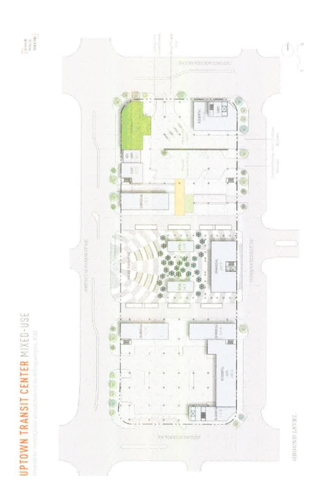
Exhibit C Project Site Plan