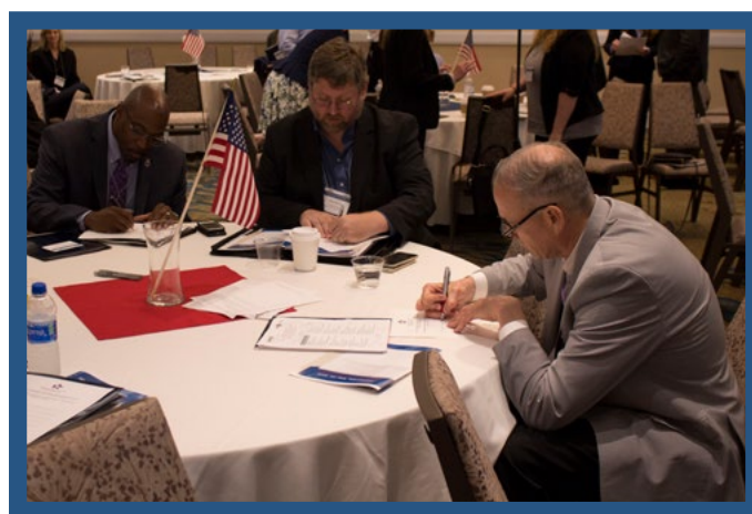
Conference Participants Fill Out Networking Worksheets, Day 1

Synopsis: Suicide postvention policies and procedures are a critical component of an employer’s overarching suicide prevention strategy. Postvention is intended to facilitate the healing process of individuals from the grief and distress of suicide loss. Postvention also helps mitigate other negative effects of exposure to suicide and can help prevent suicide among people who are at high risk after exposure to suicide.