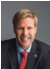
Timothy M. Keller, Mayor The City of Albuquerque