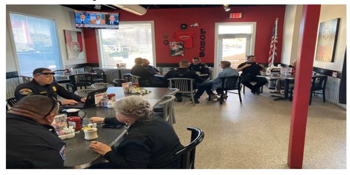
Westside Business Association meeting at the Sombremesa Restaurant with