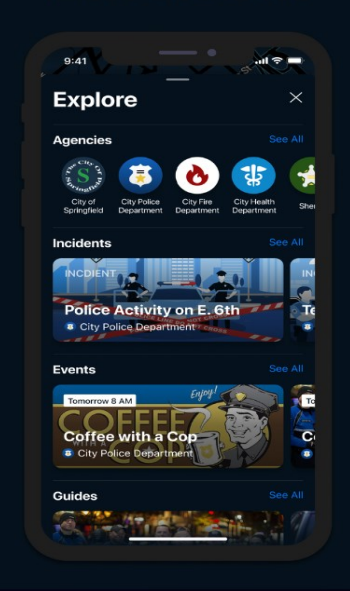
Receive Personalized Safety Alerts