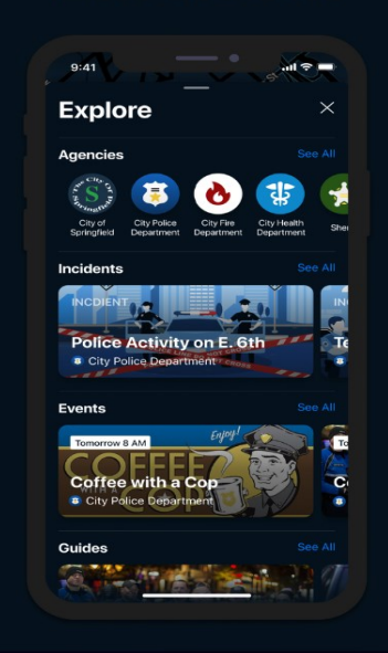
Receive Personalized Safety Alerts