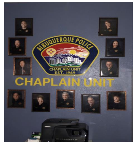
2022 May Highlights