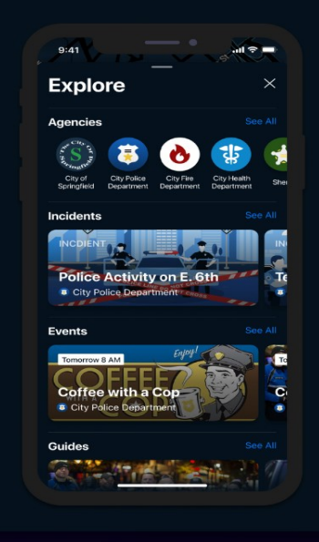
Receive Personalized Safety Alerts