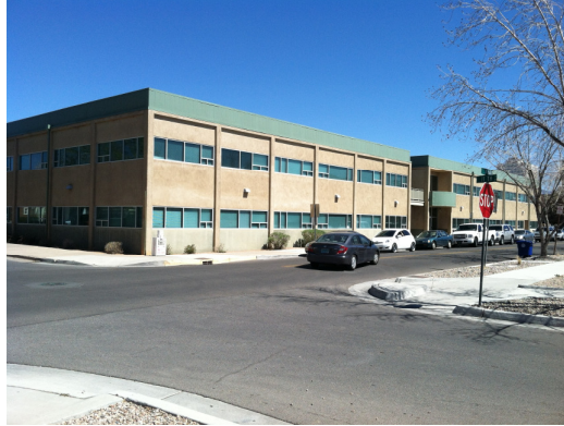
(Office building at 1015 Tijeras NW as viewed from 1100 Tijeras NW)