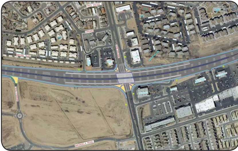
Conceptual Single-point Diamond Interchange at Montano Road