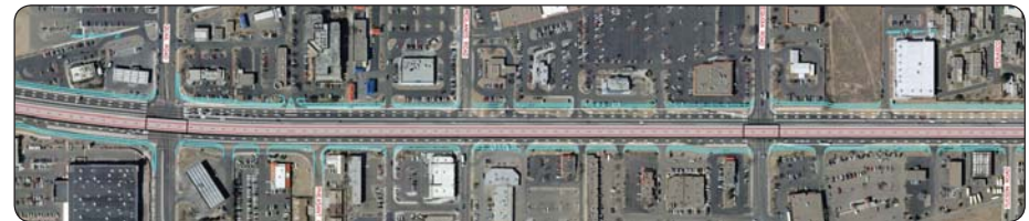
Conceptual Grade-Separated, Elevated Roadway from Quail Road through Sequoia Road