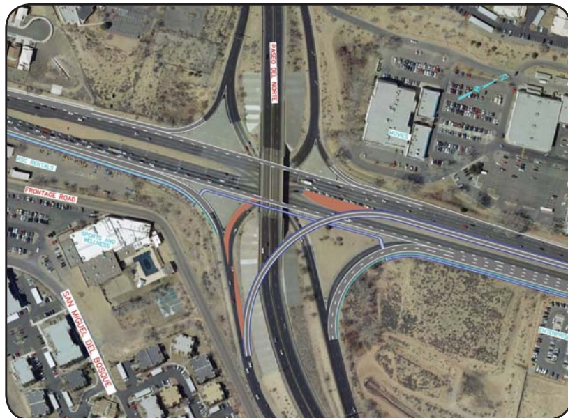
Conceptual New Flyover Ramp at Paseo del Norte