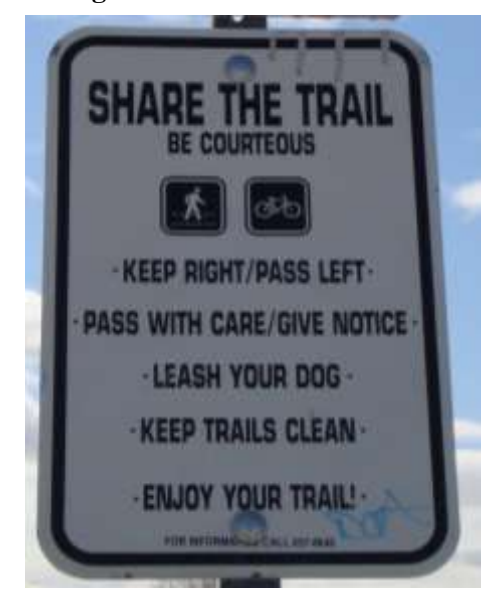
Figure 2: Trail Etiquette Signs

Future studies or evaluations of the trail system could focus on identifying known conflict of use areas and recommending ways to encourage separation of use. High-use areas or conflict points include Tingley Park and the Gail Ryba Bridge. Increasing awareness of trail etiquette and communication would be handled as an education program, which is a currently ongoing program. For more information on current and new programs, see Chapter 5 , Recommended Programs .