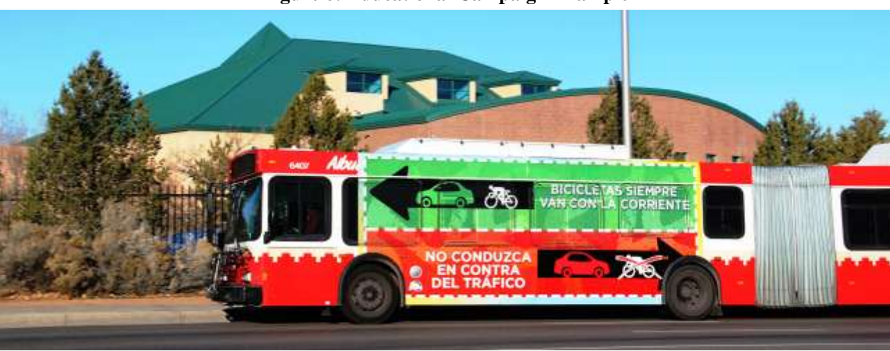
Figure 6: Educational Campaign Example

Because most of the on-street locations were signalized intersections, the violations at these intersections were running red lights. Few cyclists were seen running a red signal indication without first stopping at the approach. The second most common violation was riding on the wrong side of the street in a bike lane. In 2014, the City prepared an education campaign to address this issue by providing billboards on ABQ Ride buses that were targeted at bicyclists, Figure 6 .