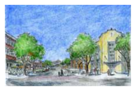
Village Center Character Zone