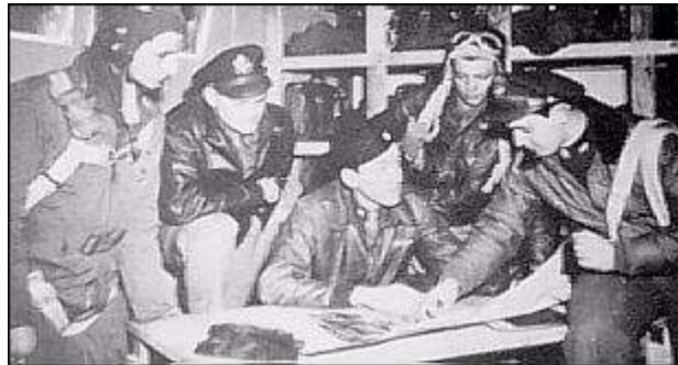
Stewart talking Over the final details of a mission prior to takeoff.

of 1943 when he went to England as Commanding Officer of the 703rd Bomb Squadron, equipped with B-24s. Stewart ended the war with 20 combat missions and remained in the USAF Reserve. Brigadier General Stewart retired 31 May 1968.