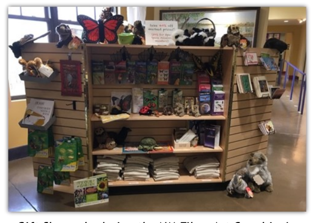
Gift Shop sale during the NM Fiber Art Crawl in June.

You may have seen us spreading the word about the Open Space Alliance at any of the events at the Open Space Visitor Center, Sandia Labs, Valle de Oro Build Your Refuge Day, REI or other events Where we set up a table dedicated to our cause. Memberships help us fund OSD projects, along with generous donations from individual members and businesses, grants, fundraisers and limited Gift Shop sales. REI has been a great partner and supporter of the Open Space Alliance over the years. Last year they funded half the cost of trail counters so that the OSD could start collecting some hard data on Open Space land use. This year REI is helping us pay for half the cost of a plan to design new signs and kiosks for each of the Open Space properties. We look forward to a continued partnership!