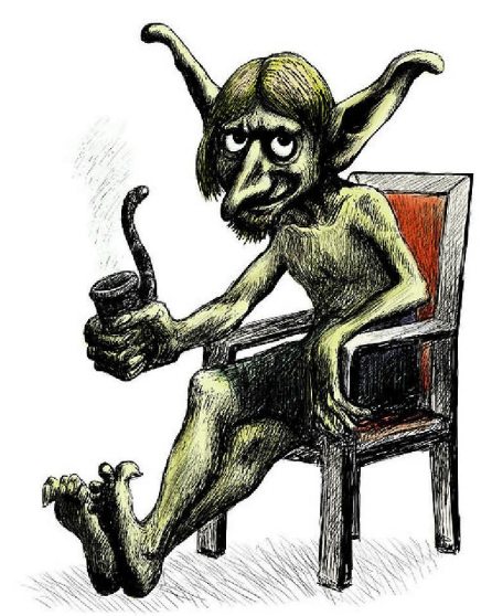
Local guest contributor to your most reliable source of fake Open Space news