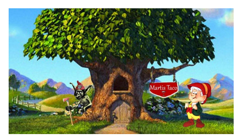
El Duende on vacation visiting his friend Ernie

El Duende recently took a vacation to visit some friends who bake cookies in a tree. It's an odd way to make a living if you ask El Duende, but they seem to enjoy it. Speaking of trees, El Duende had a great time working in the bosque for Dia del Rio. This year the Open Space Division teamed up with our friends at the BioPark to host Dia del Rio at Tingley Beach. Projects took place at both Tingley Beach and in the bosque along Tingley Drive. BioPark staff led projects to clean up old fishing line and to plant native plants around the main fishing pond, while Open Space staff led projects that included trash cleanup, new trail construction and trail maintenance. The BioPark staff was very generous in donating goodie bags to thank all the volunteers who participated, as well as donating other prizes for the free raffle held at the end of the project.