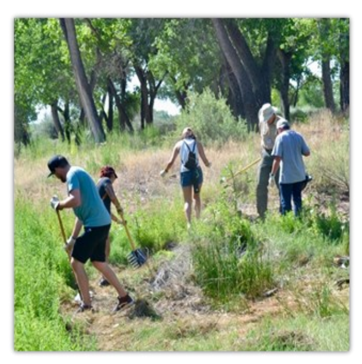
Trail maintenance on the Bosque Trail behind the Open Space Visitor Center, adopted by the Open Space Alliance.

In 2019, that funding helped pay for snacks and other supplies for 10 clean up and trail maintenance projects including the new Tijeras Arroyo Open Space that was added to the City's Open Space lands.