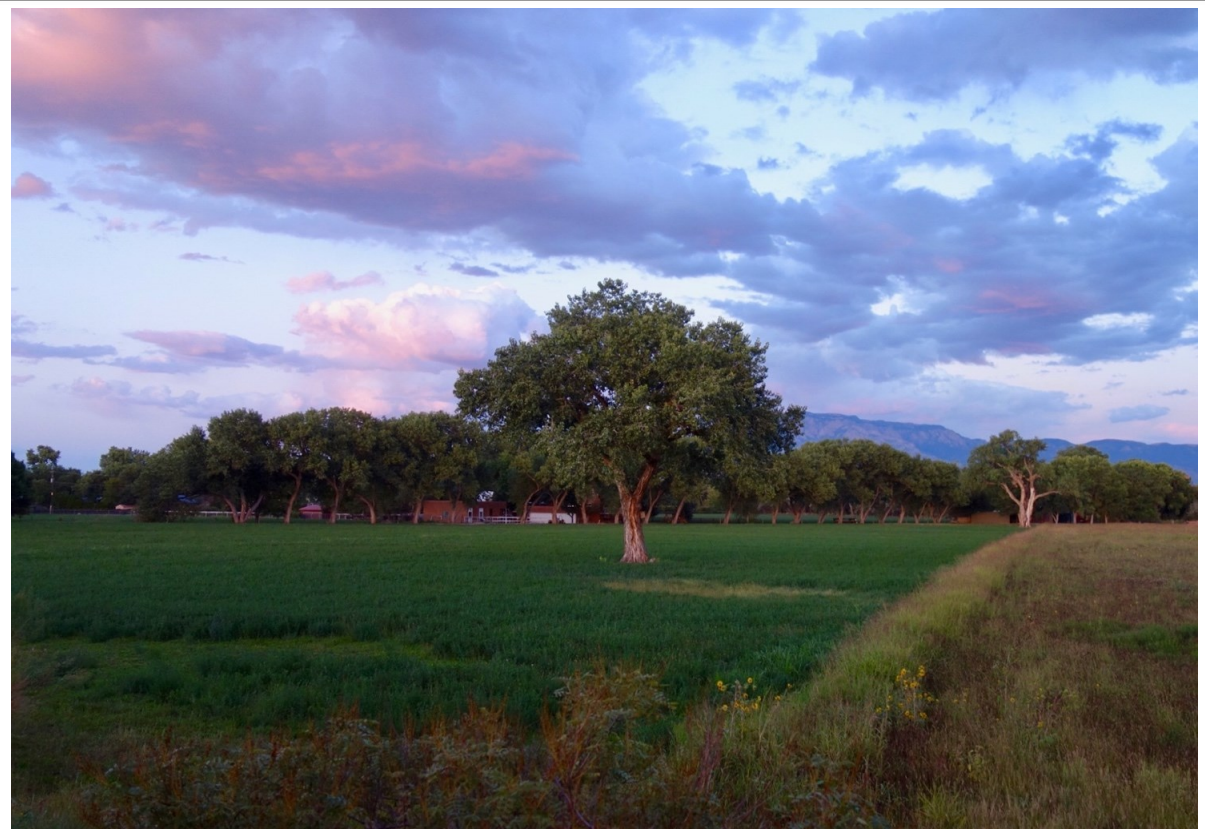
Sunset from the Open Space Visitor Center during the OSD Campfire and Storytelling Celebration in September.