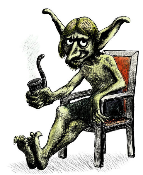
Local guest contributor to your most reliable source of fake Open Space news

Twenty members of the New Mexico Unidentified Flying Object (NMUFO) Club turned out for a trail project at the Elena Gallegos Picnic Area in March. The trail project was actually sponsored by the New Mexico Volunteers For the Outdoors (NMVFO), but a typo in the Alibi called for volunteers