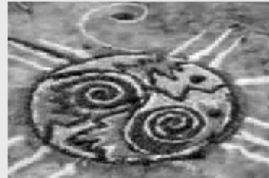
On the trail or in the gallery, art displays offer the visitor a visual interpretation & expression of the natural beauty in Open Space.

The Open Space Alliance is a nonprofit organization whose purpose is to promote public awareness and conservation of Open Space lands. Find out more about OSA at a special annual event on Saturday, January 25 th 10:00 am. http://openspacealliance.org/