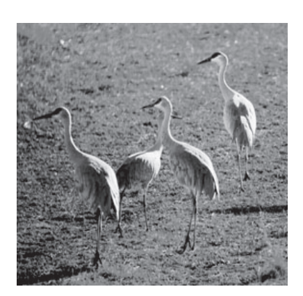
The success of an omnivore is measured in oneness with the present. Serenity produced by soft and deliberate footsteps reveals abundance within our chosen resting places. To live adroit and unencumbered is our desired path on earthen soil and above it. That path will lead us south soon. Days pass. The aperture of warmth and light has come and gone in our summer home, so too have the many blessings of abundance grown scarce. We listen to and feel the season's messages, for our bodies are shaped by them. Eons of ancestral migration have carved our wings, our patterns, and presence into the banks and slopes of this river, embedded in clay and sand lay our deliberate footprints. Tethered golden leaves sigh, a chill whispers across the glassy surface of the river. Our direction is clearly marked by gravity's tow. It is time to go...