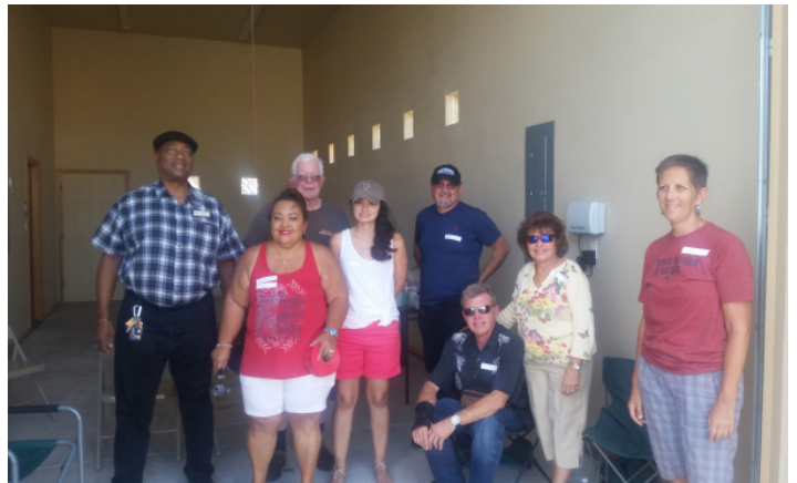
Above: Saltillo Neighborhood