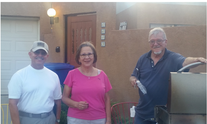
Above: San Blas Neighborhood

includes answers to several Frequently Asked Questions (FAQs) raised by the public, and numerous other project resources.