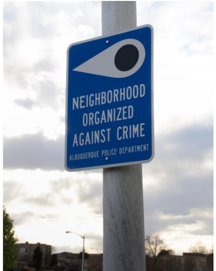
Neighborhood Watch photo courtesy of Ricky Garcia, New Mexico News Port. Used with permission.

The unique needs and resources of each neighborhood will determine which of these options may be right for any particular association.