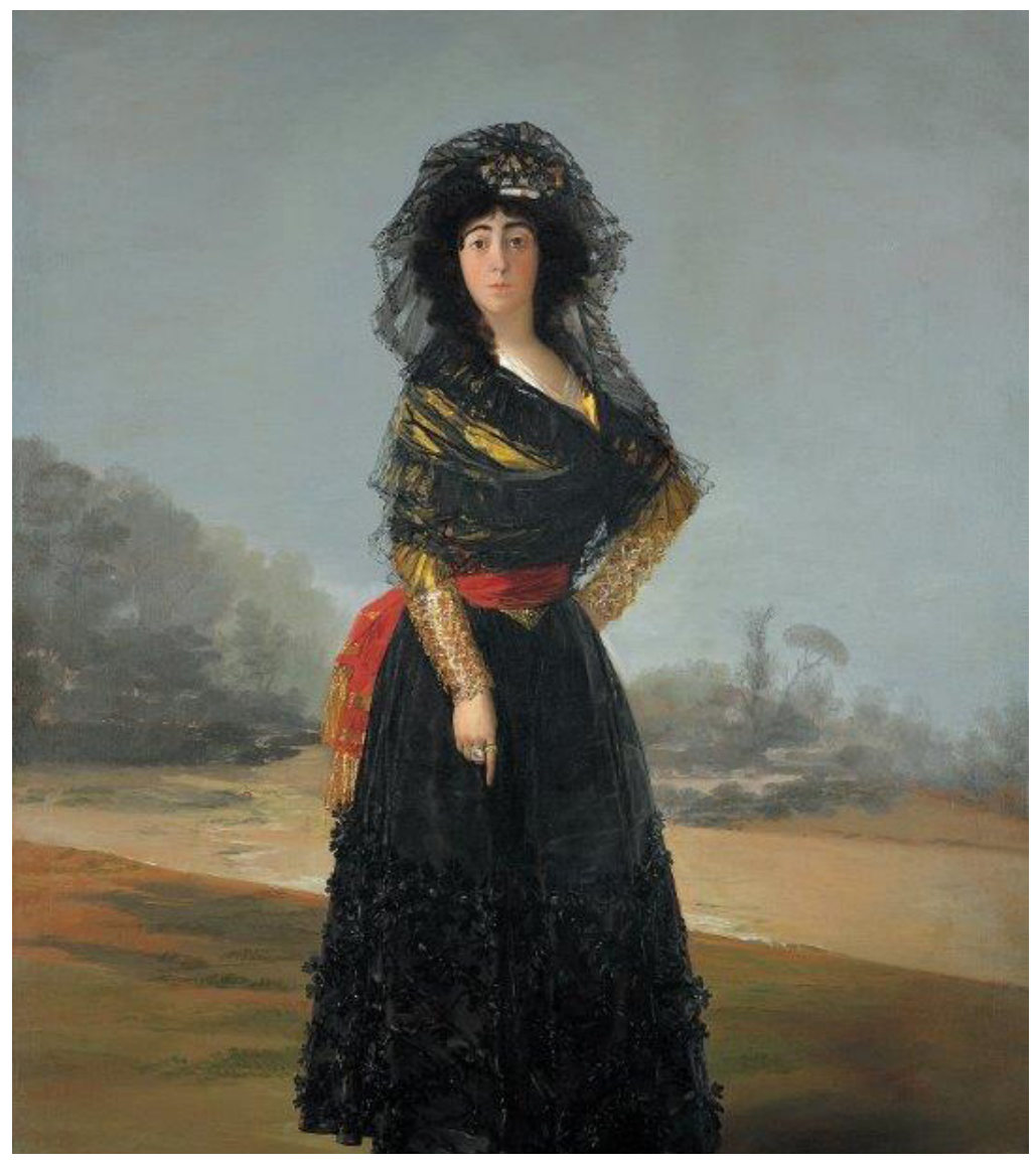
Above: Goya y Lucientes, Francisco de (1746 Fuendetodos, Spain – 1828 Bordeaux, France); The Duchess of Alba; 1797; Oil on canvas

In Gallery 1 of the museum, you'll find pieces from Ancient, Islamic, Medieval, Golden Age Spain, Colonial, and 19th century Latin America, including works by El Greco, Velázquez, and Zubarán. Gallery 7 features decorative arts from the Ancient Regime and paintings from modern Spain, including works by Goya, Joaquín Sorolla y Bastida, and John Singer Sargent.