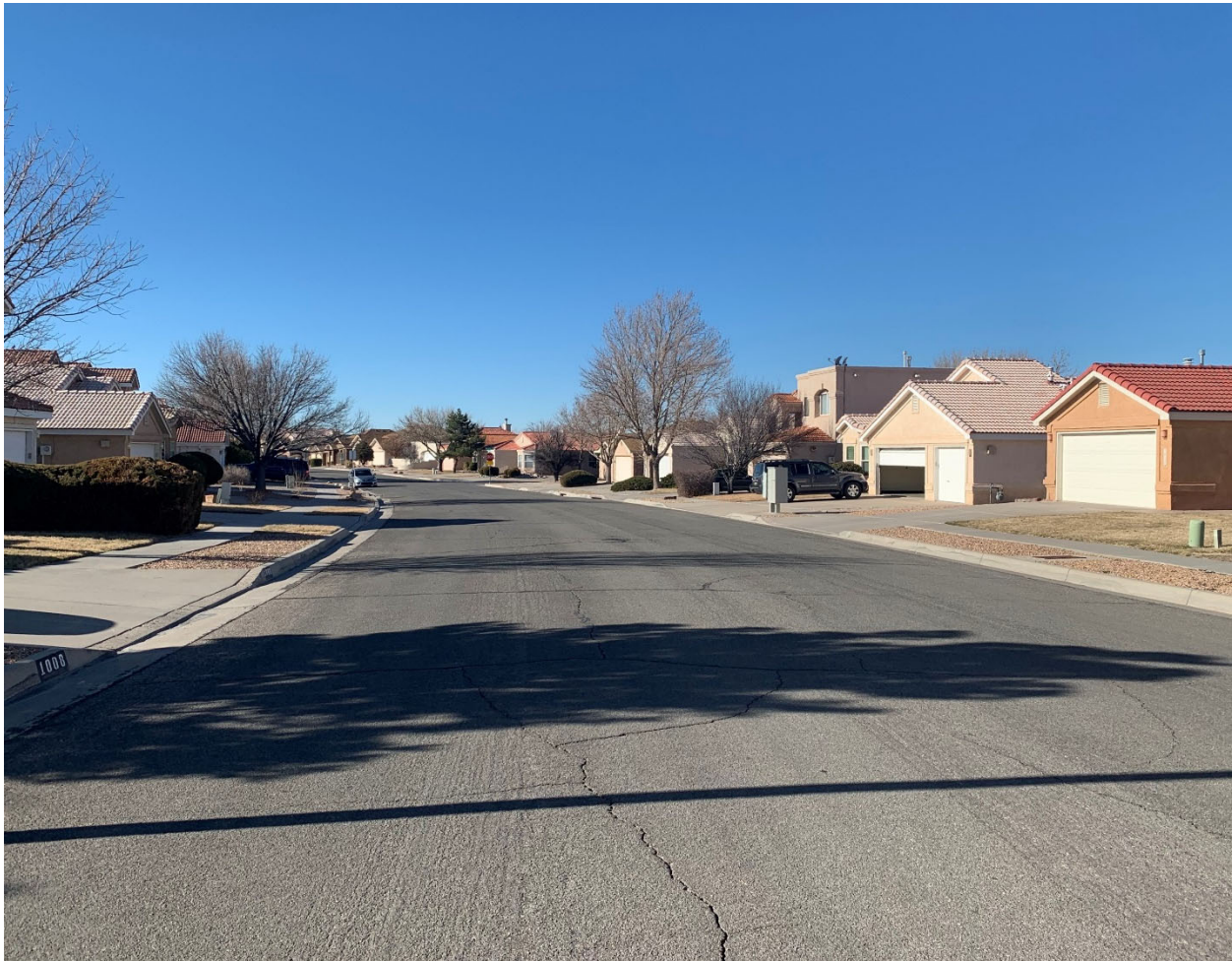
Figure 4: Tony Sanchez Drive Looking South