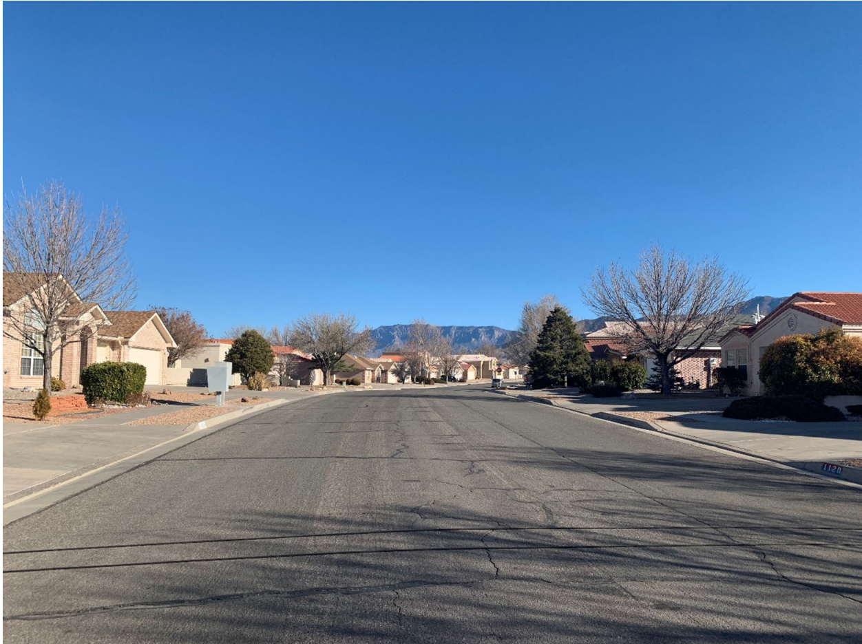
Figure 3: Tony Sanchez Drive Looking North

Tony Sanchez Drive is a 36-ft wide roadway with curb and gutter, a 5-ft buffer and a 4-ft wide sidewalk on both sides of the roadway. See Figure 3 and Figure 4 for photos of the existing roadway, and Figure 5 for the existing Tony Sanchez Drive typical section.