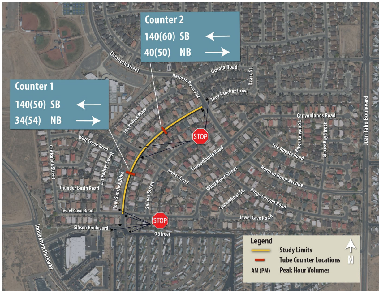
Figure 1: Project Area and Existing Traffic Volumes

Tony Sanchez Drive is located in Albuquerque, New Mexico, and is a two-lane, undivided local street that runs south to northeast. Herman Roser Avenue and Jewel Cave Road are also two-lane, undivided local streets. Herman Roser Avenue runs generally northwest to southeast and intersects the northern end of the project area, while Jewel Cave Road runs east-west and crosses the southern end of the project area. Both streets cross Tony Sanchez Drive at a T-intersection. See Figure 1 for a map of the project area. The project area is located in a residential area approximately one half-mile east of Kirtland Air Force Base and a similar distance south of Central Avenue.