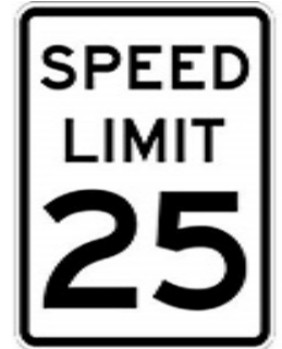
Figure 2: Tony Sanchez Drive Speed Limit

Existing tube count data (volume, speed, and class) was collected for 48-hours on Wednesday, January 29, 2020, and Thursday, January 30, 2020. See Figure 1 for the peak hour volumes. Less than 1% of vehicles were buses or heavy vehicles. The full traffic count data can be found in Appendix A .