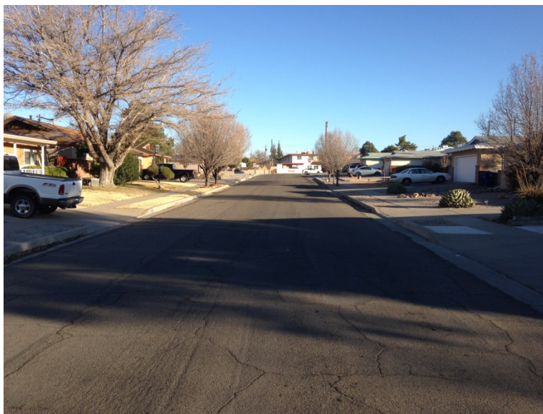
Figure IV.B.3 Bellehaven Avenue south of Indian School Road

Sidewalk, landscape buffer, curb and sidewalk exist on both sides of Bellehaven Avenue. Below is a photo showing the cross-section listed above.