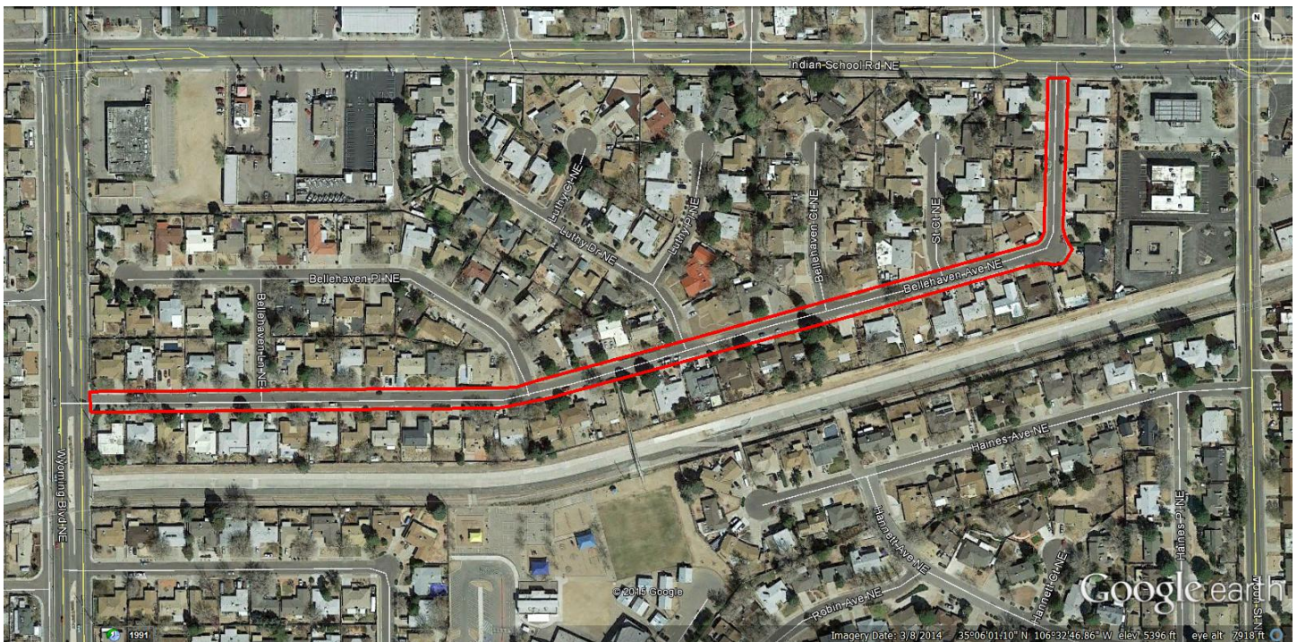
Figure III.A.1 Project Vicinity Map

Please refer to Figures III.A.1 below showing the project area.