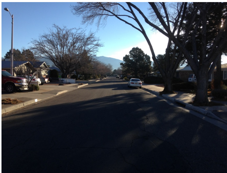
Figure IV.B.1 Bellehaven Avenue east Wyoming Boulevard

Sidewalk, landscape buffer, curb and sidewalk exist on both sides of Bellehaven Avenue. Below is a photo showing the cross-section listed above.