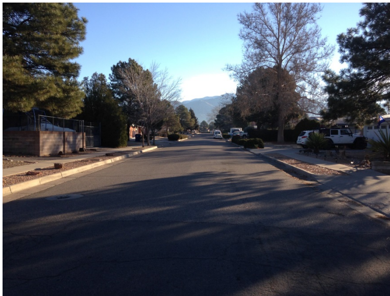
Figure IV.B.2 Bellehaven Avenue east of Luthy Drive

Sidewalk, landscape buffer, curb and sidewalk exist on both sides of Bellehaven Avenue. Below is a photo showing the cross-section listed above.