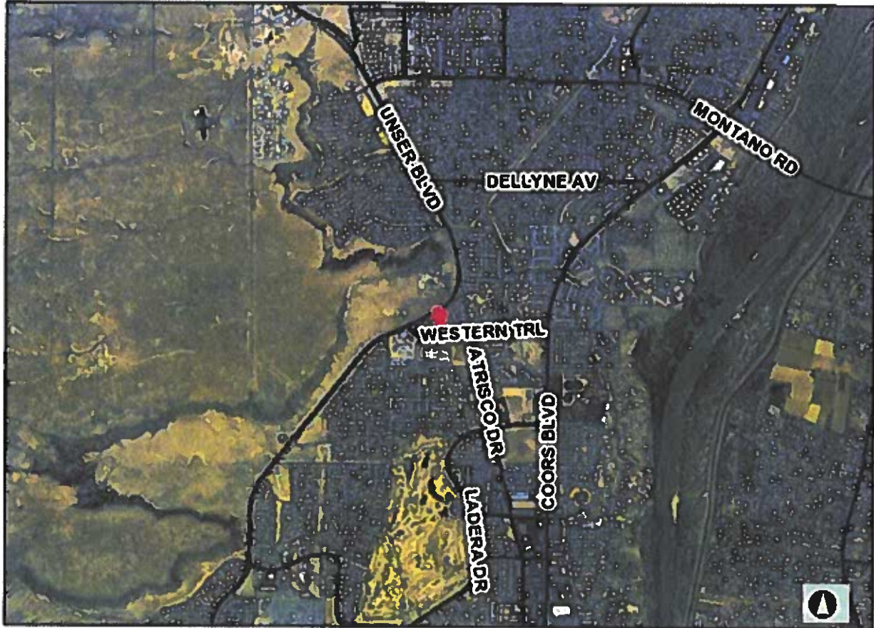
Citywide Overview Map: