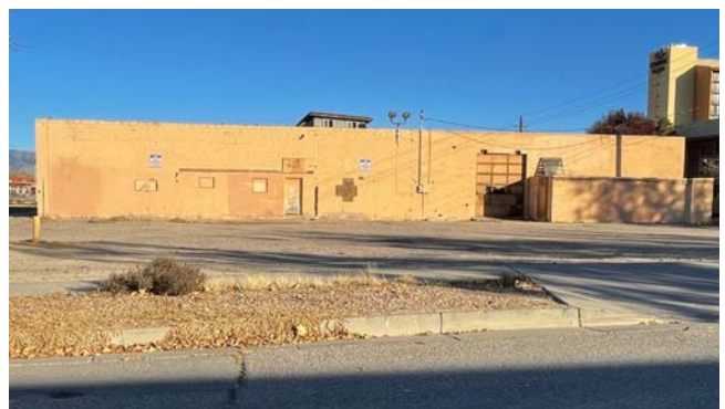
Vacant and deteriorated structures, above: Little Anita's; Right: Village Inn, Range Cafe, Krav Maga, and warehouse building.