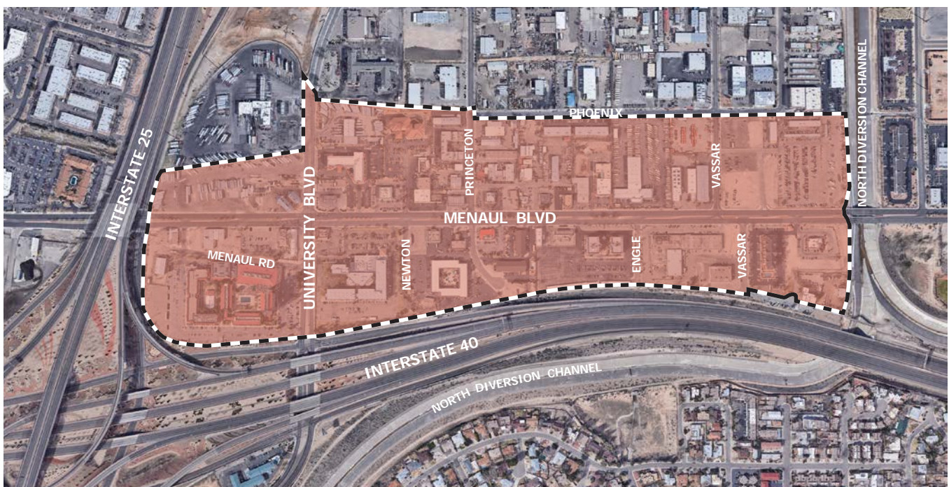
PROPOSED MENAUL METROPOLITAN REDEVELOPMENT AREA BOUNDARY