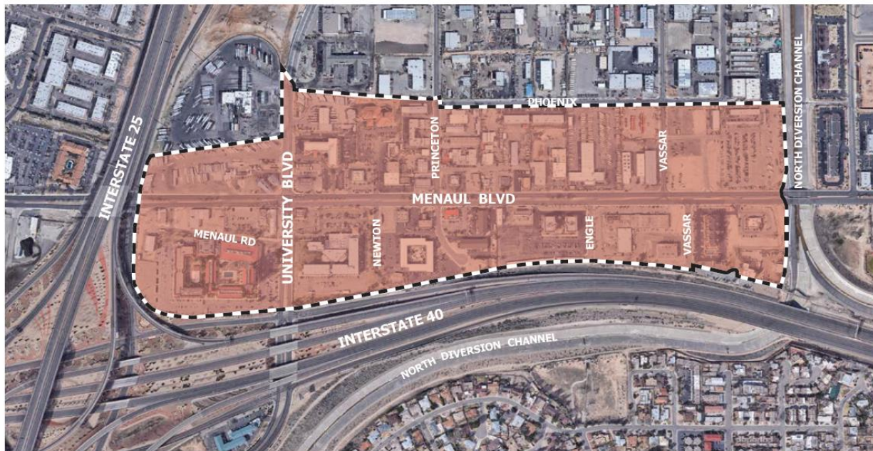
PROPOSED MENAUL METROPOLITAN REDEVELOPMENT AREA BOUNDARY

City Council Services is proposing to create a new Metropolitan Redevelopment Area to include the commercial corridor along Menaul between I-25 and the North Diversion Channel. Please see the attached draft Menaul Redevelopment Area Designation Report. The geographic boundaries of the area (see map below) were determined through the recently adopted Menaul Redevelopment Study (Phase 1) completed by Consensus Planning on behalf of Albuquerque City Council Services. Legislation designating the Menaul Metropolitan Redevelopment Area was introduced to City Council and deferred to ADC for recommendation.