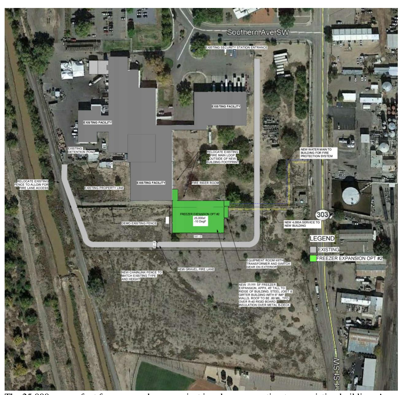
The 25,000-square foot freezer warehouse project involves connection to an existing building. A map of the area is above. Infrastructure, parking, and utilities are already developed. As mentioned, no extension or relocation of utility or road systems is anticipated. There are adequate utilities and roads to the facility.