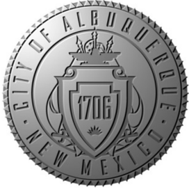
Exhibit B City of Albuquerque Metropolitan Redevelopment Agency