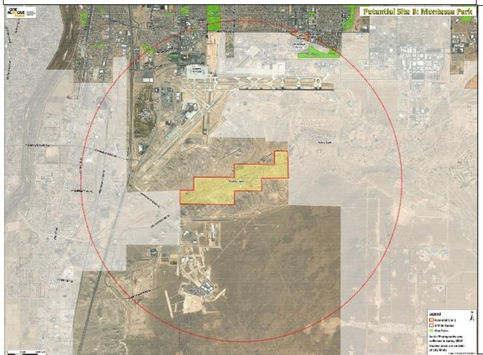
<u>Figure 4: Potential Site B, Montessa Park</u> Property is indicated with a red boundary with a 3-mile radius

The majority of breakout rooms thought that Site B, Montessa Park did not meet or barely met the common criteria of 1) low impact on neighborhood, 2) ease of access to services, 3) ease of access to transportation, and 4) high level of safety and security. However, several rooms thought that the potential site would meet criteria for low impact on neighborhood.