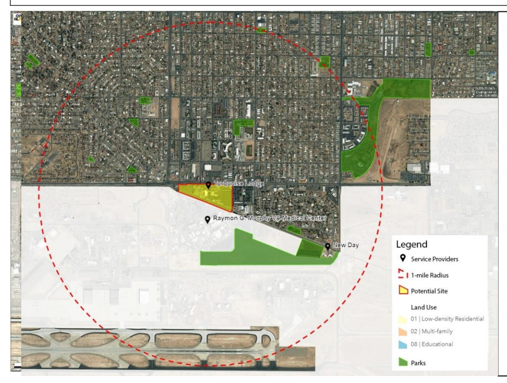
Figure 3: Potential Site A - Former Hospital on Gibson: The property is indicated with a red boundary at the center of a 1-mile radius

The majority of rooms thought that Site A, the Former Hospital on Gibson well or very well met the common criteria of 1) low impact on neighborhood, 2) ease of access to services, 3) ease of access to transportation, and 4) high level of safety and security.