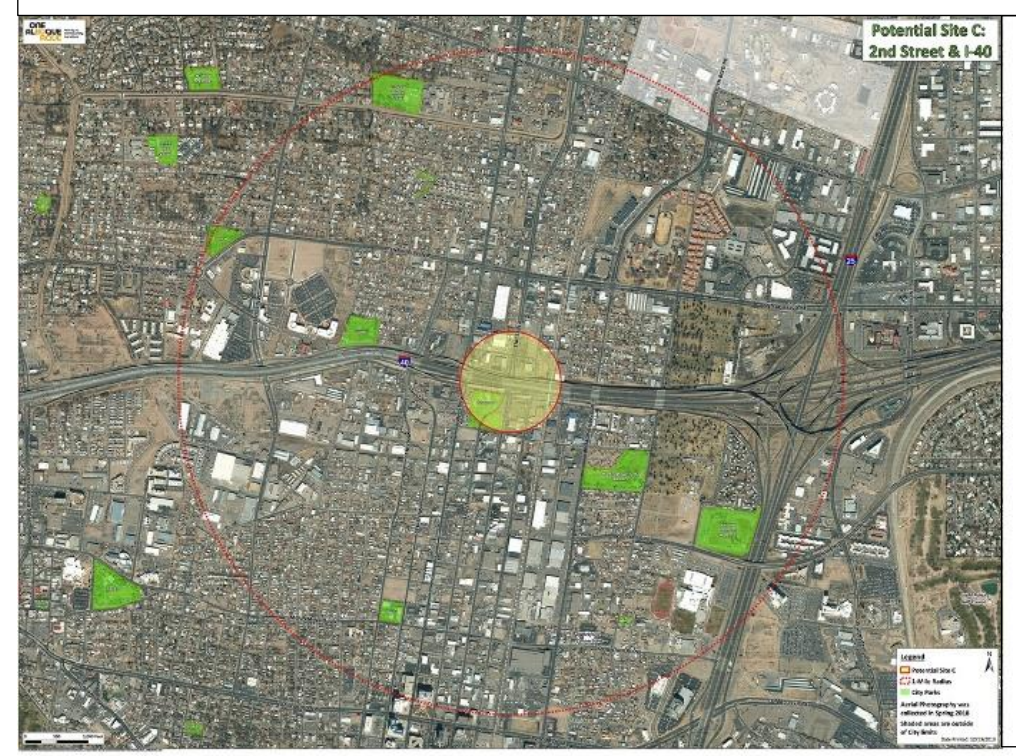
Figure 5: Potential Site C, Second Street & I-40 Area Property is indicated with a small highlighted circle along with a 1-mile radius

Participants in all rooms thought Potential Site C Second Street & I-40 Area well or very well met the common criteria of ease of access to services and ease of access to transportation. However, all groups thought that this site would have an impact on the neighborhood and were mixed on how well the site would meet a high level of safety and security.