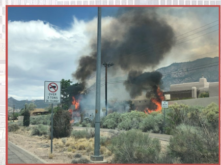
A brush fire on Tramway Blvd NE caused by arcing powerlines, successfully extinguished by AFR crews.