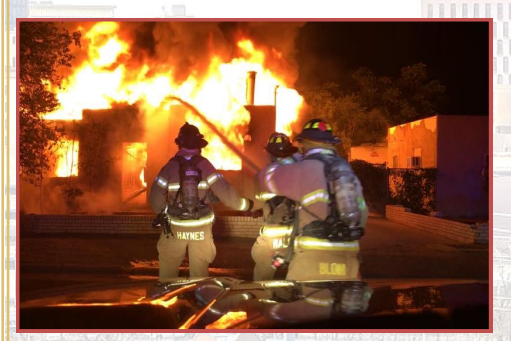
Multiple crews battled an abandoned house fire in fire district 7, no injuries reported.

7/4 - Bosque fire near Central SW and Sunset Blvd NW in fire district 7.