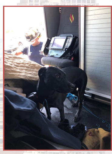
The crew of Engine 3 discovered and safely removed this dog from an apartment fire.