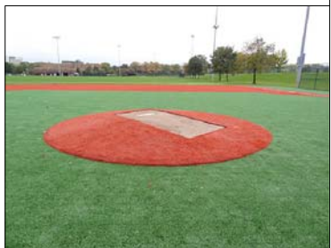
SYNTHETIC TURF W/CLAY LANDING AREA