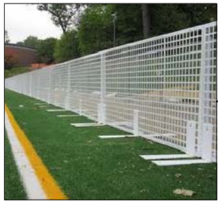
PORTABLE OUTFIELD FENCE