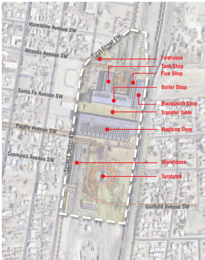
Configuration of existing primary buildings on the rail yards site.