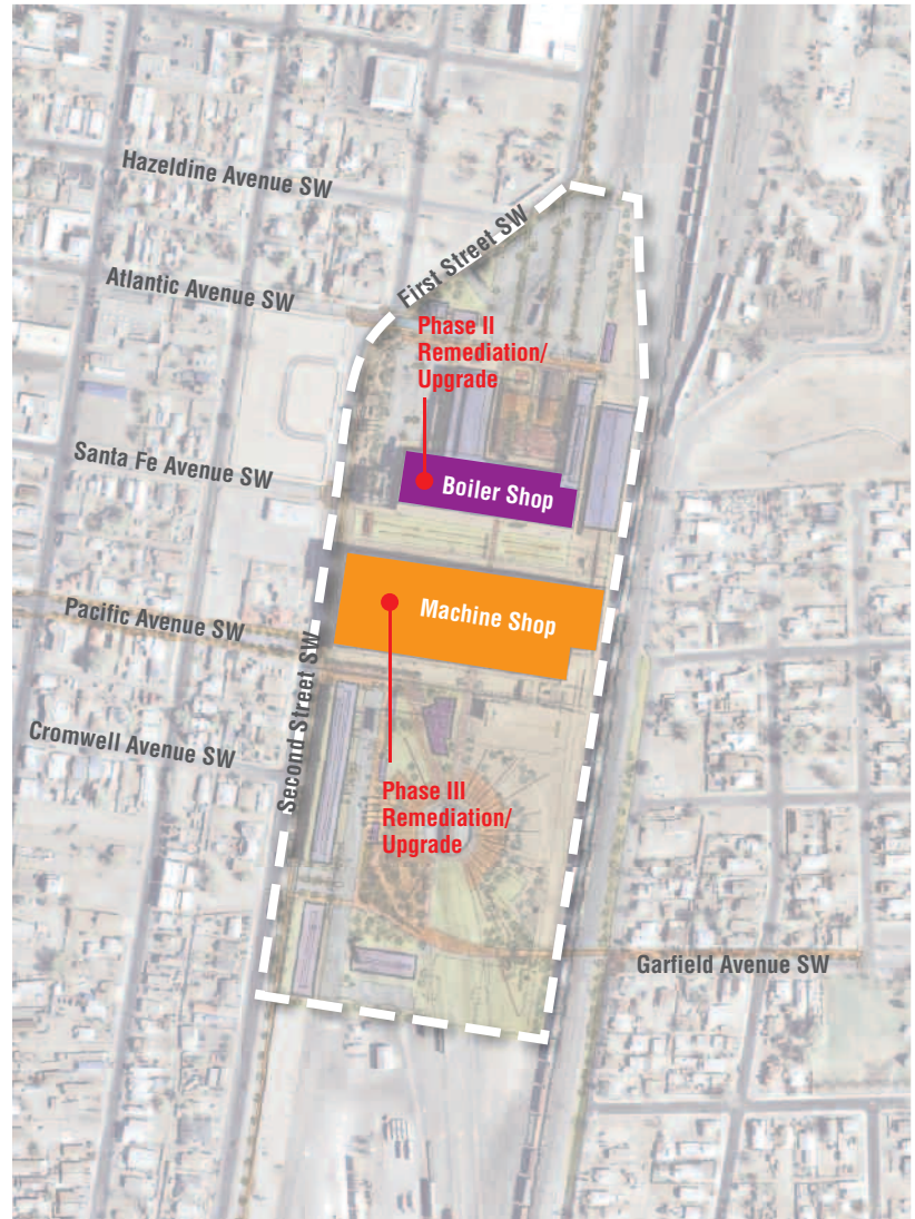
Proposed Phase II and III development program.

Thorough examination of relevant planning processes has informed and shaped the panel's development program for the rail yards. Proceeding