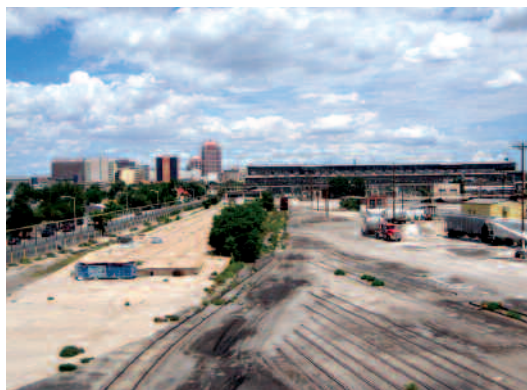
The 27-acre rail yards with downtown Albuquerque in the background: promoting pedestrian connections between the two is a primary goal proposed by the panel.

Using these premises, the panel was asked to focus on addressing the following questions: