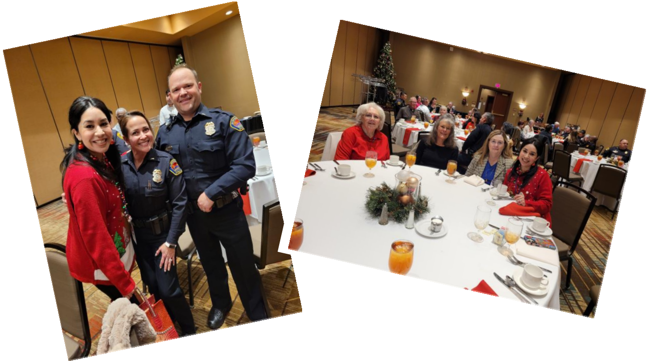
Community Policing Council Appreciation Holiday Dinner

virtual interview after receiving the application, also resulted in more effective process to fill our council.