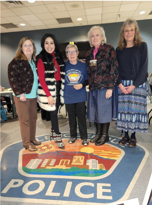
FCPC MEMBERS GRADUATING FROM THE 59TH CITIZEN POLICE ACADEMY CLASS DECEMBER 1, 2022