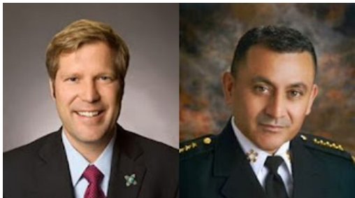
Keller and Gonzales

It was always unlikely but imagine if now former Bernalillo County Sheriff Manny Gonzales--aka Machine Gun Manny--had defeated Mayor Keller in the 2021 election? Today the Mayor would have a possible indictment hanging over him charging him with trafficking in