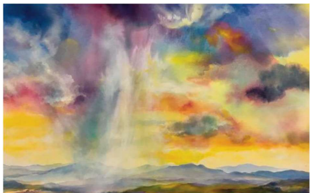
Angus Macpherson, "Colors Above Jemez," 2014, acrylic on canvas, 4.17' x 6.33'