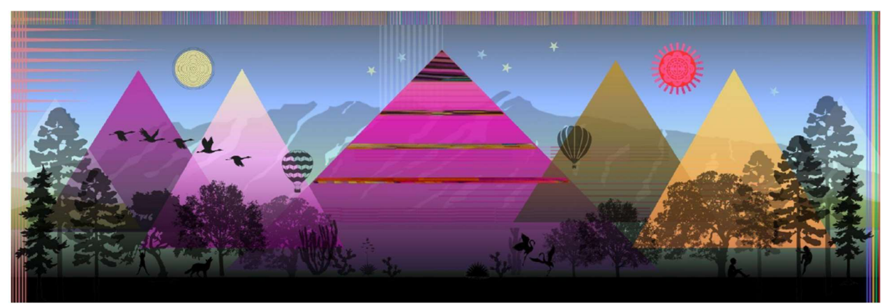
J P 제피, We are of the Mountain, mixed-media mural, 17' x 50'

proposals. J P 제피's proposal, entitled, We are of the Mountain , was selected for the TSA North Wall Commission site, pictured below. J P's We are of the Mountain will be recommended to City Council for Award. Installation will begin once approved by City Council.