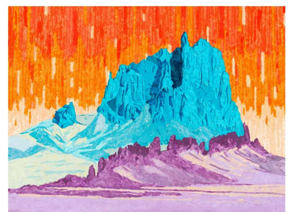
Virginia Primozic, "Sailing," 2021, paper on canvas, 2.5' x 3.33' x 1.5"

TSA North Wall Commission – Commission of two-dimensional or low-relief, threedimensional artwork for the TSA North Wall in the queueing area.