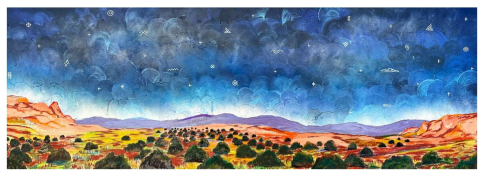
Jesse Littlebird, "Monsoon season up near Abiquiu," 2023, oil on canvas, 2.83' x 8'

Deborah Jojola, "Equilibrium," 2023, fresco with earthen plaster and pigments, 2.96' x 1.5' x 1"