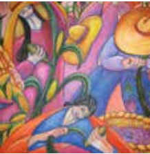
5 The Harvest Gilberto Guzman 128 5th and Copper Parking Structure