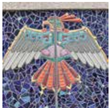
13 ASI Harwood Mosaic 610 Convention Center East building