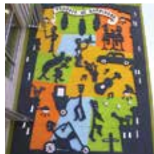
21 Unquenchable Spirit 637 Lorenzo Romero Workforce Housing 2nd & Lomas