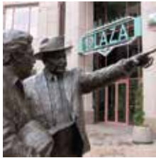
6 Sidewalk Society Glenna Goodacre 119 3rd and Tijeras (Southwest corner)