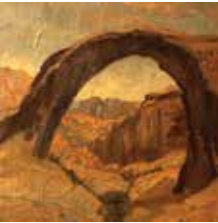
3 Von Hassler murals Carl von Hassler 491 KiMo Theatre 423 Central Ave