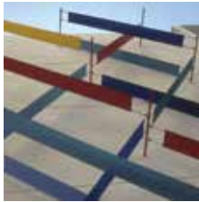
4 Gridlock Ramsey Rose 182 5th and Copper Parking Structure