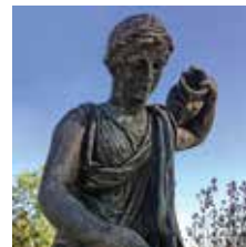
22 Braden Memorial 553 Mott Ironworks Robinson Park 8th & Central