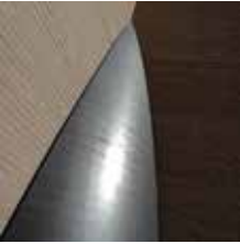
1 Cone 10 Tom Waldron 216 Main Library 501 Copper Ave