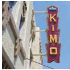
17 KiMo Sign Historic Reprod. 605 Kimo Theatre 421 Central Ave.