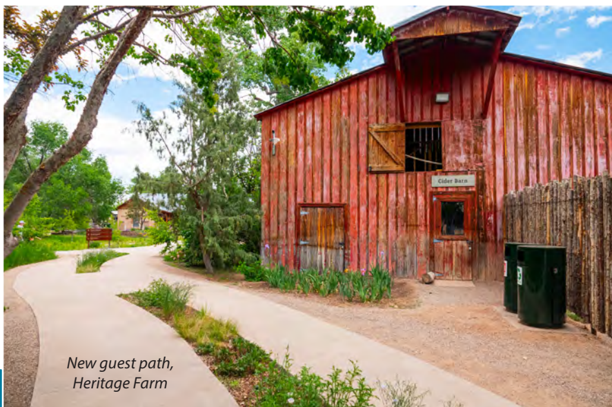
New guest path, Heritage Farm