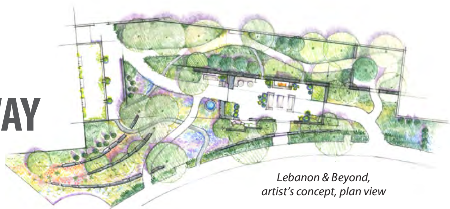
Lebanon & Beyond, artist's concept, plan view