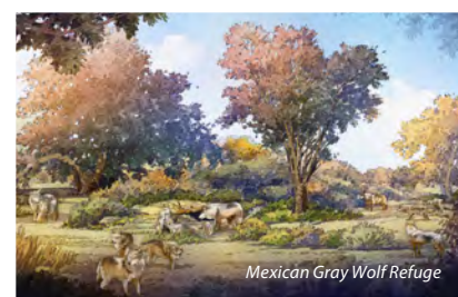
Mexican Gray Wolf Refuge

This new behind-the-scenes building at the Aquarium will support critical operations for aquatic animal care. Here, young fish will grow up, sick animals will be nursed back to health, rare corals will be raised, and more.