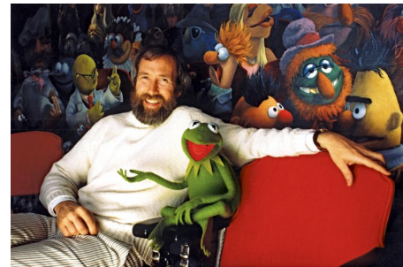
PHOTO CAPTION: Jim Henson and his iconic creation Kermit the Frog, in front of a mural by Coulter Watt. Kermit the Frog © Disney/Muppets.

ALBUQUERQUE, NM — Albuquerque Museum is pleased to announce The Jim Henson Exhibition: Imagination Unlimited . Organized by Museum of the Moving Image (MoMI), the traveling exhibition will open on November 23, 2019 and remain on view through April 19, 2020.