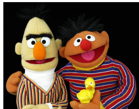
PHOTO CAPTION: Ernie and Bert from the television series Sesame Street .

$5 additional special exhibit surcharge for The Jim Henson Exhibition: Imagination Unlimited . No surcharge for children 12 and under. Surcharge applies to all others, including members, and during free days and events at Albuquerque Museum.