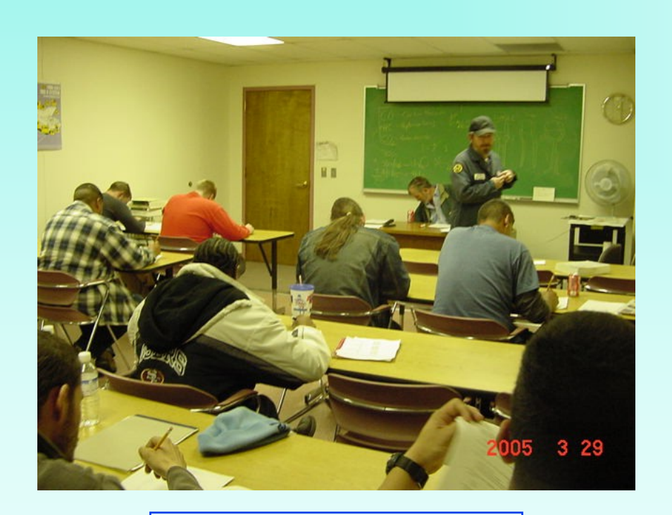
2 days classroom