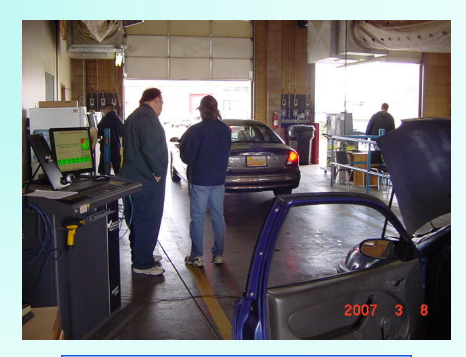
1 to 3 days practical testing