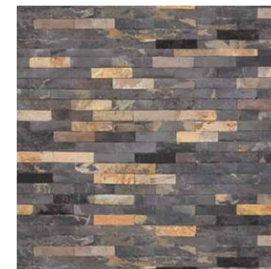
MASONRY WALL COLOR BRICK

CITY OF ALBUQUERQUE COMMUNITY SAFETY FACILITY