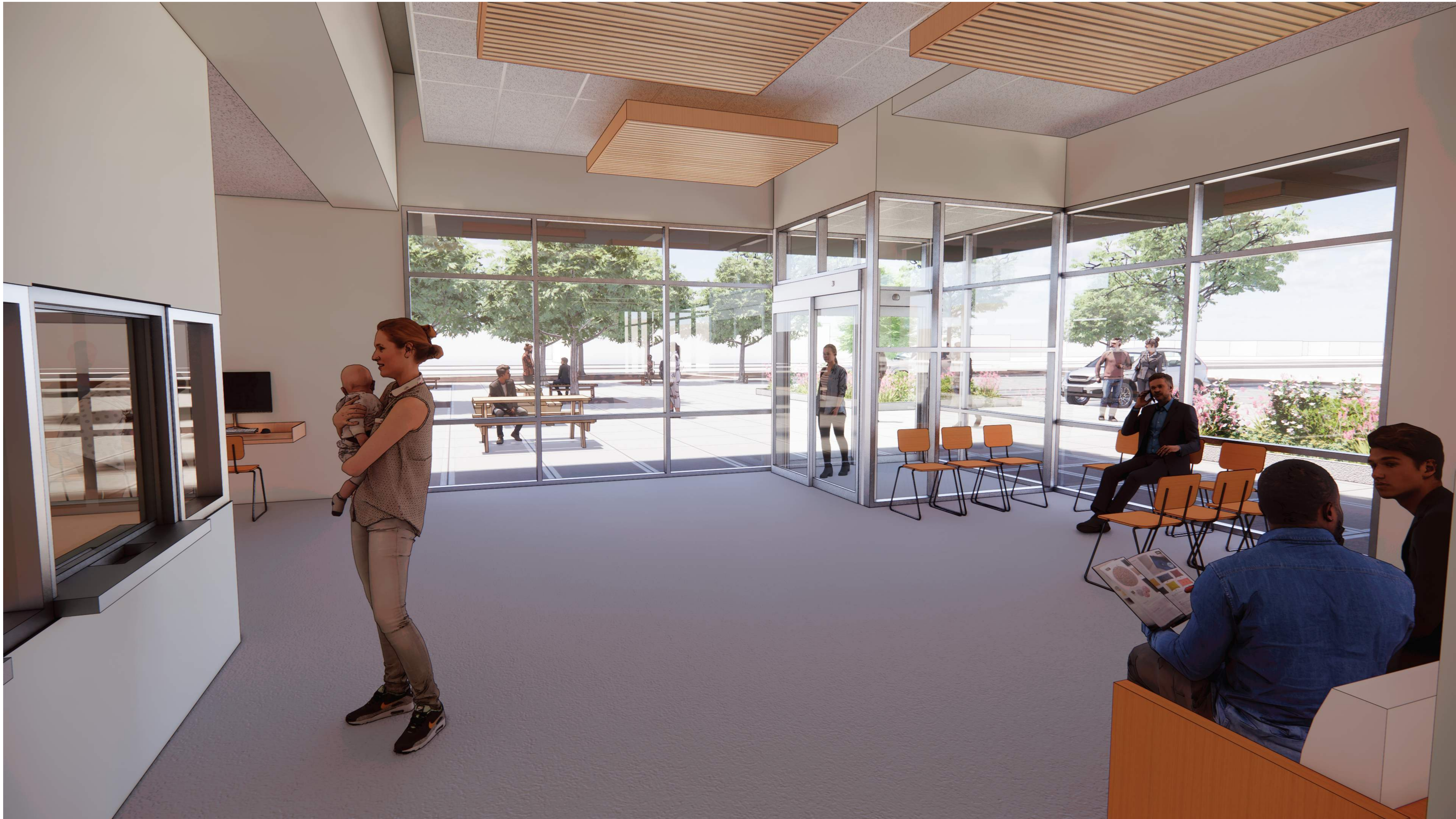
LOBBY PERSPECTIVE LOOKING NORTHWEST