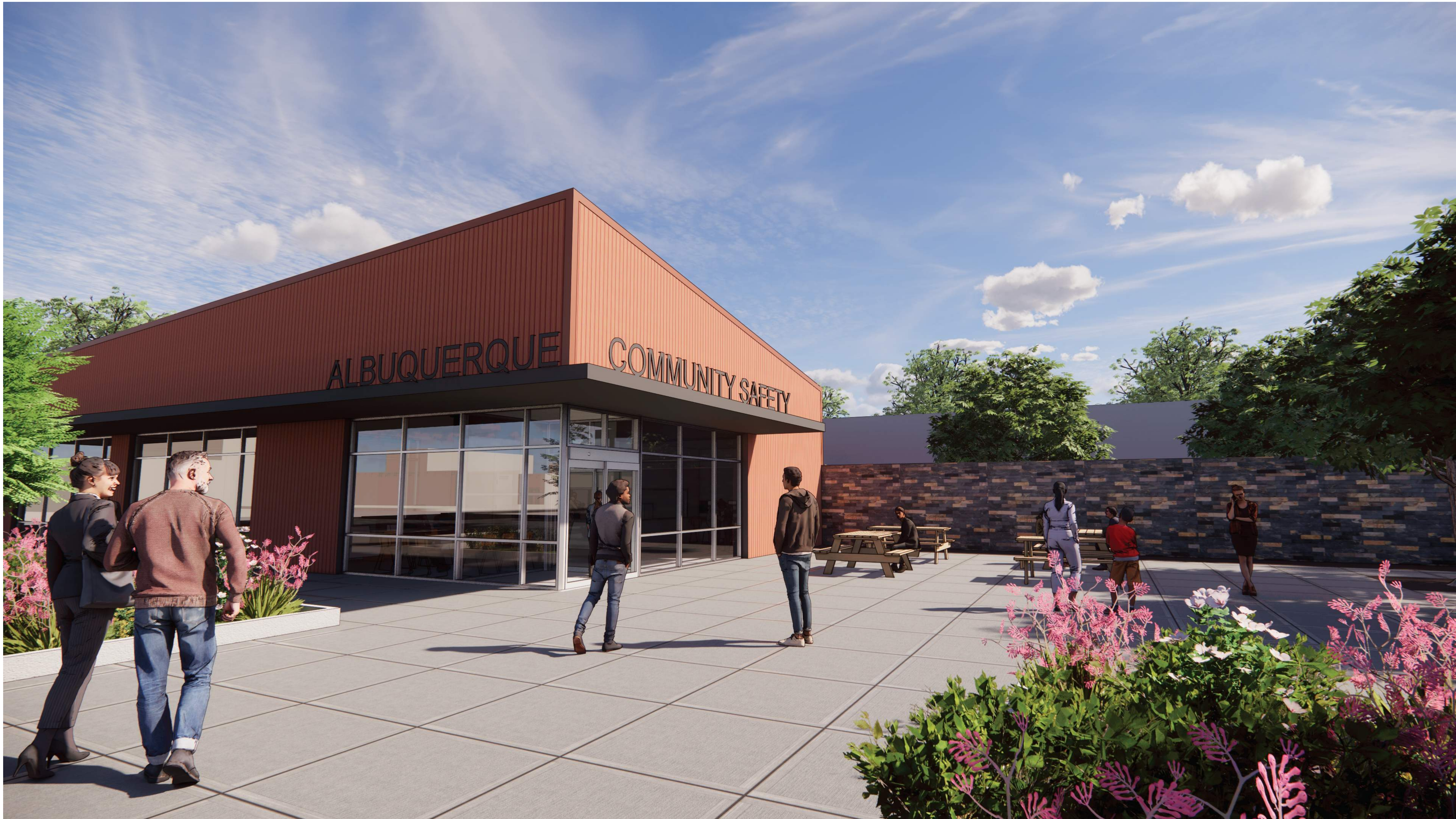
PUBLIC ENTRANCE PERSPECTIVE LOOKING SOUTHEAST