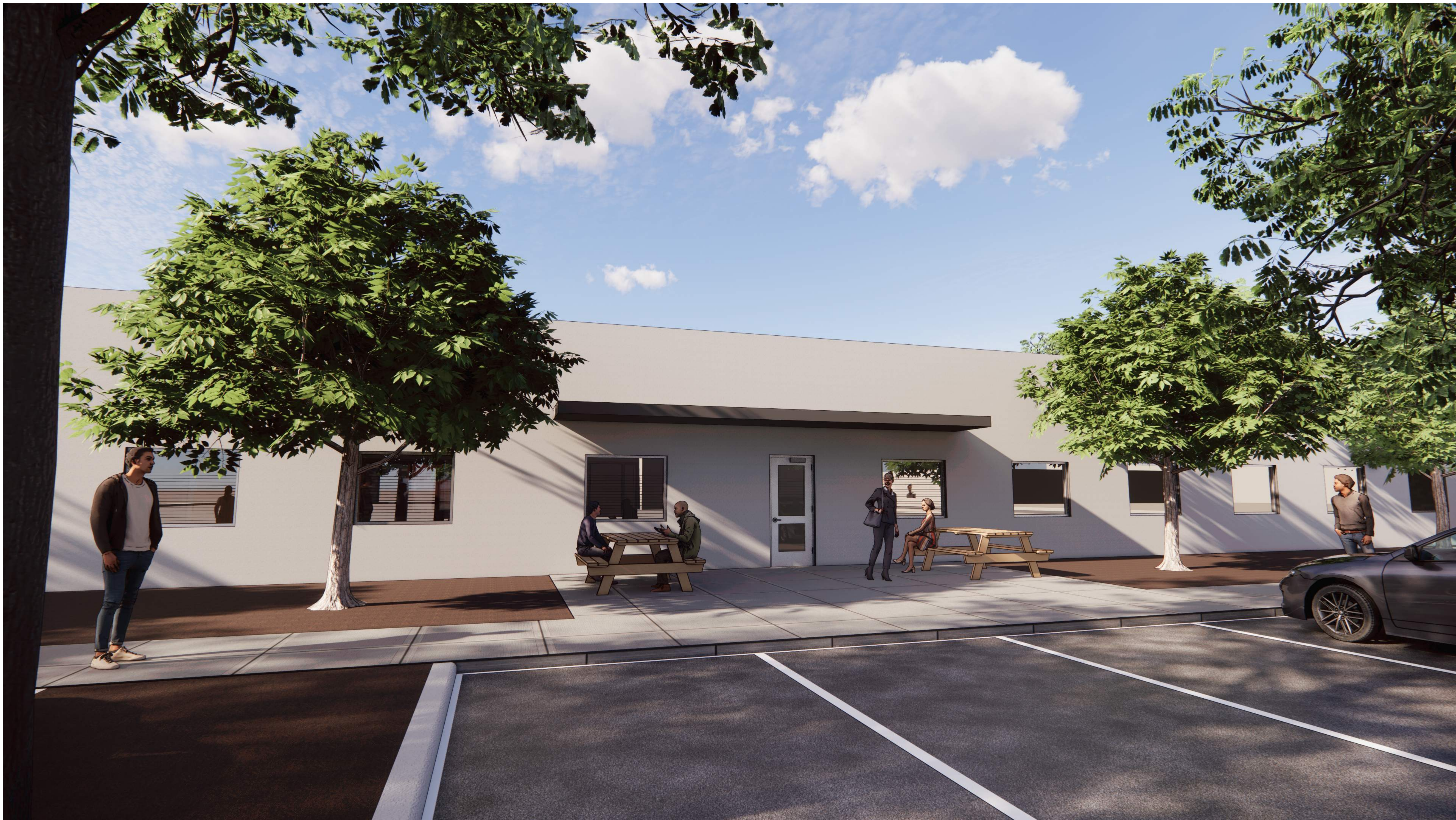
STAFF ENTRANCE PERSPECTIVE LOOKING NORTH

CITY OF ALBUQUERQUE COMMUNITY SAFETY FACILITY