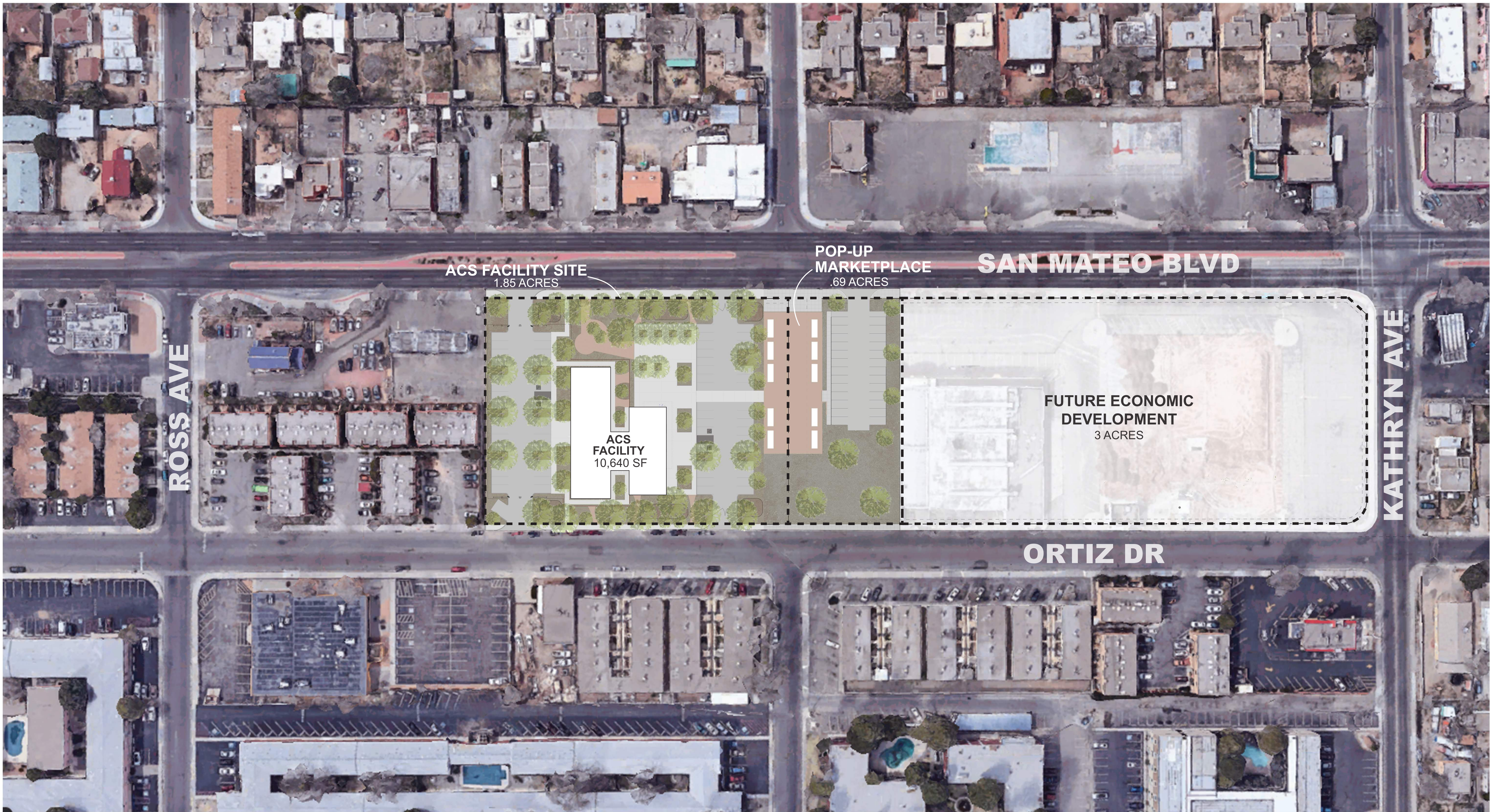
OVERALL SITE PLAN