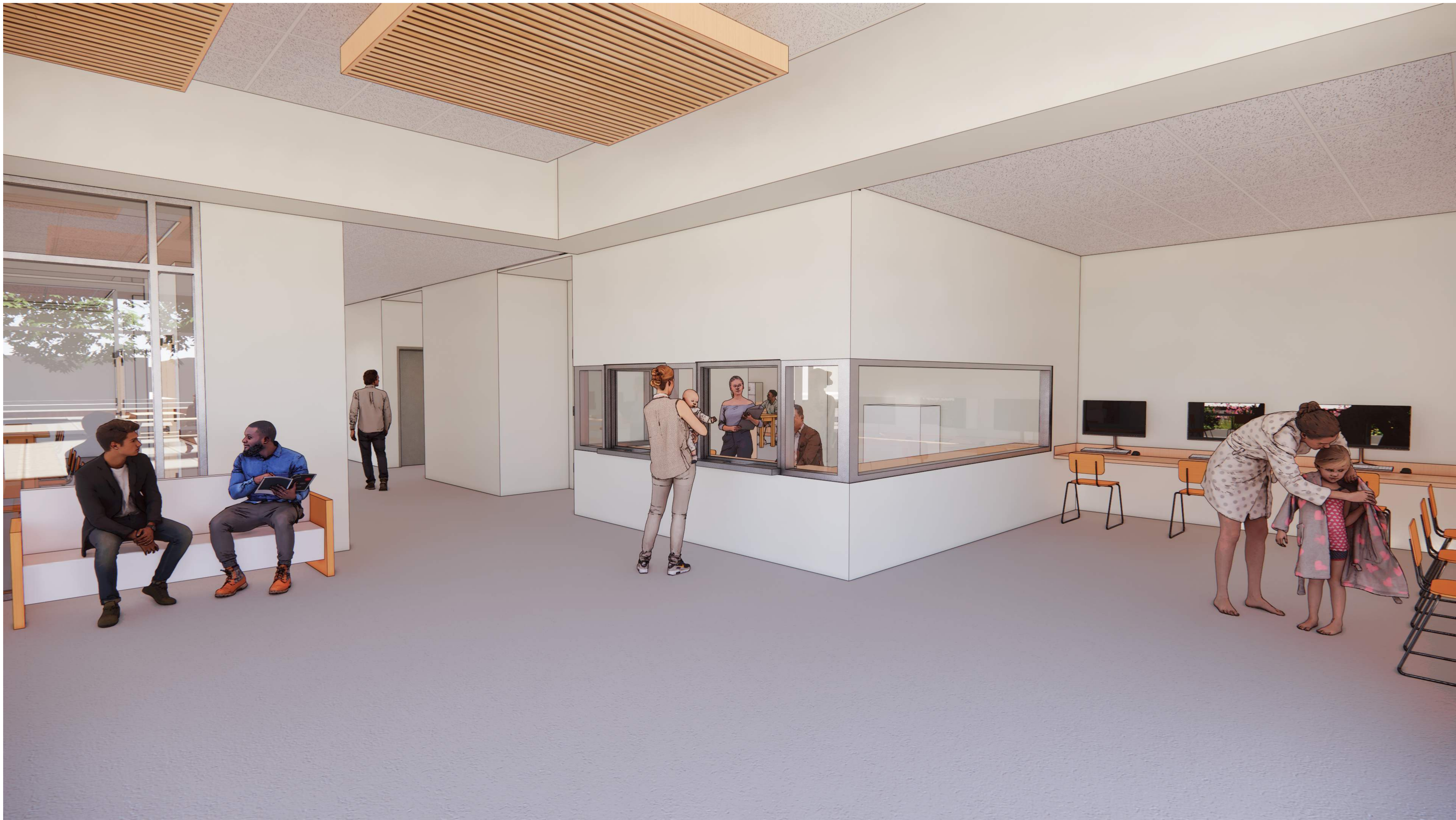
LOBBY PERSPECTIVE LOOKING SOUTEAST