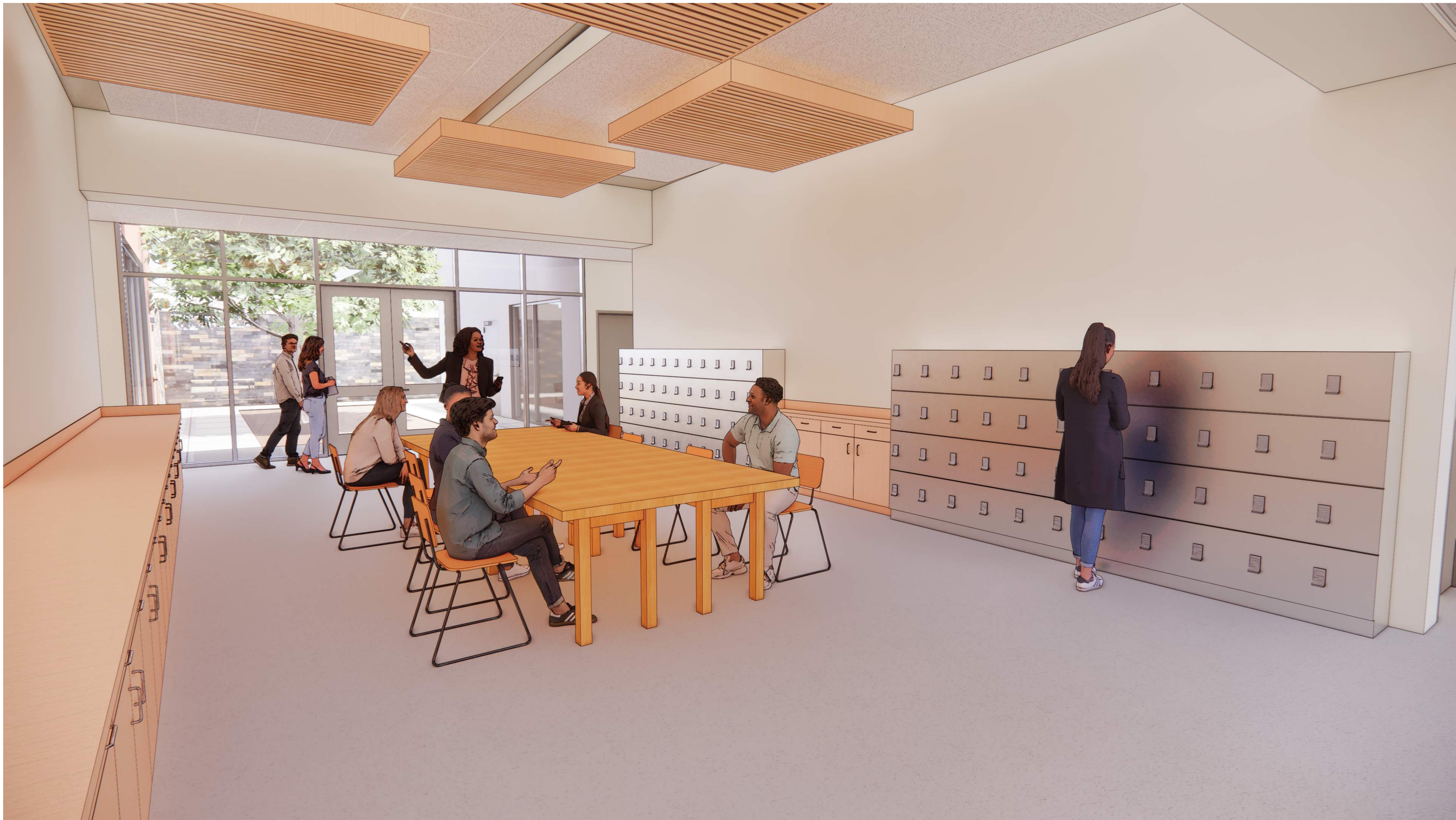
COLLABORATION SPACE PERSPECTIVE LOOKING SOUTHEAST

CITY OF ALBUQUERQUE COMMUNITY SAFETY FACILITY