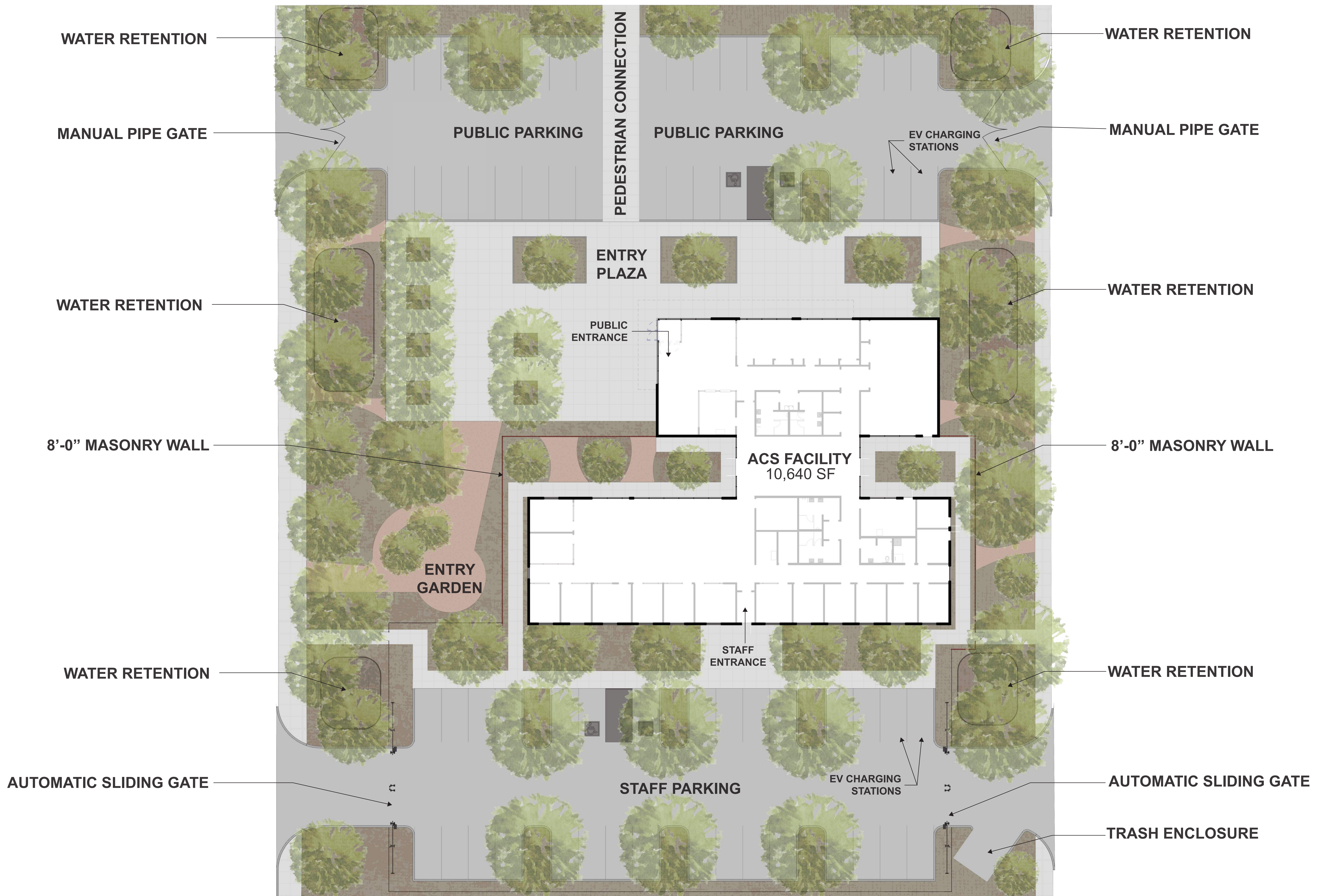
PROJECT SITE PLAN