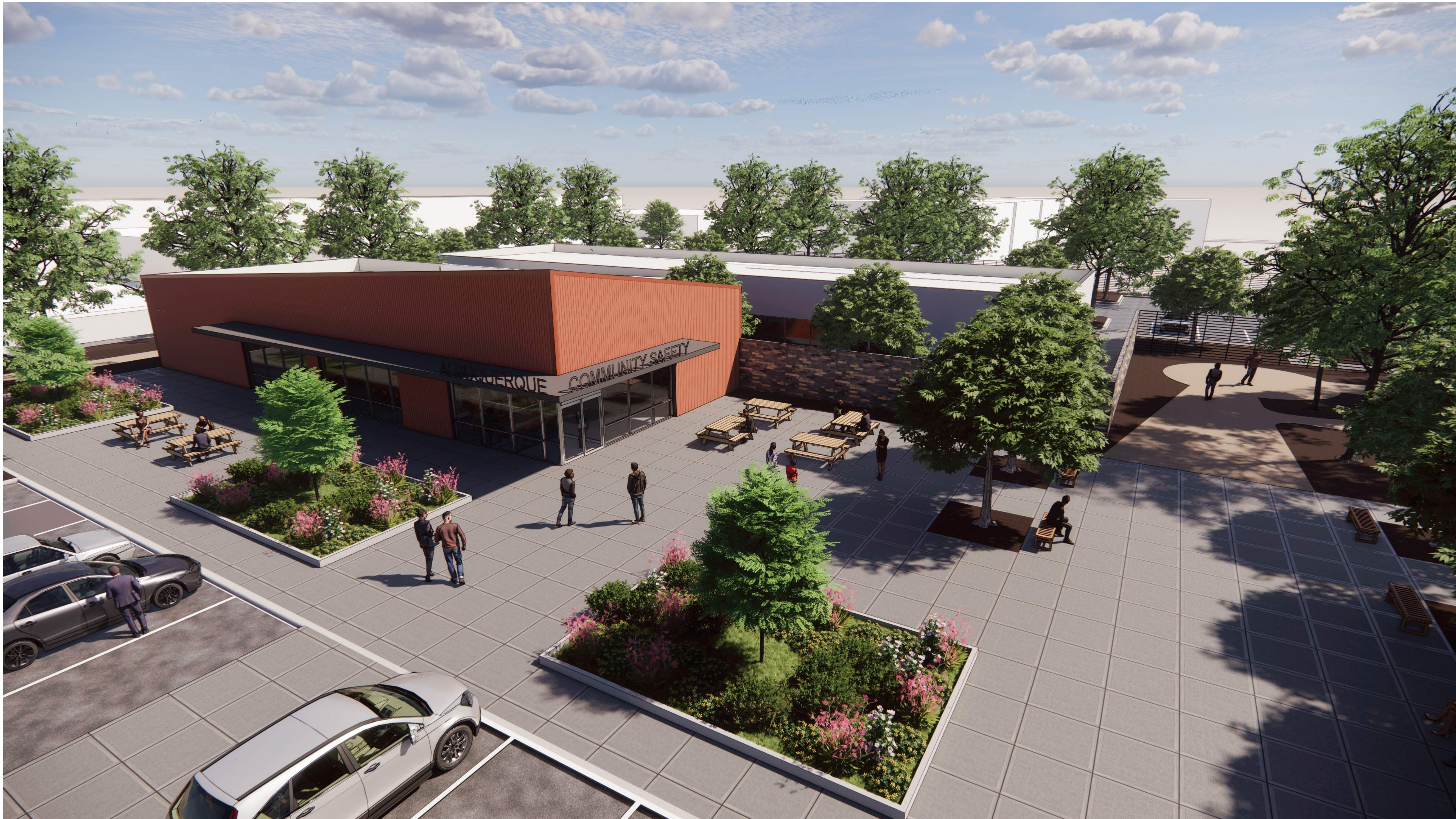
AERIAL PERSPECTIVE LOOKING SOUTHEAST