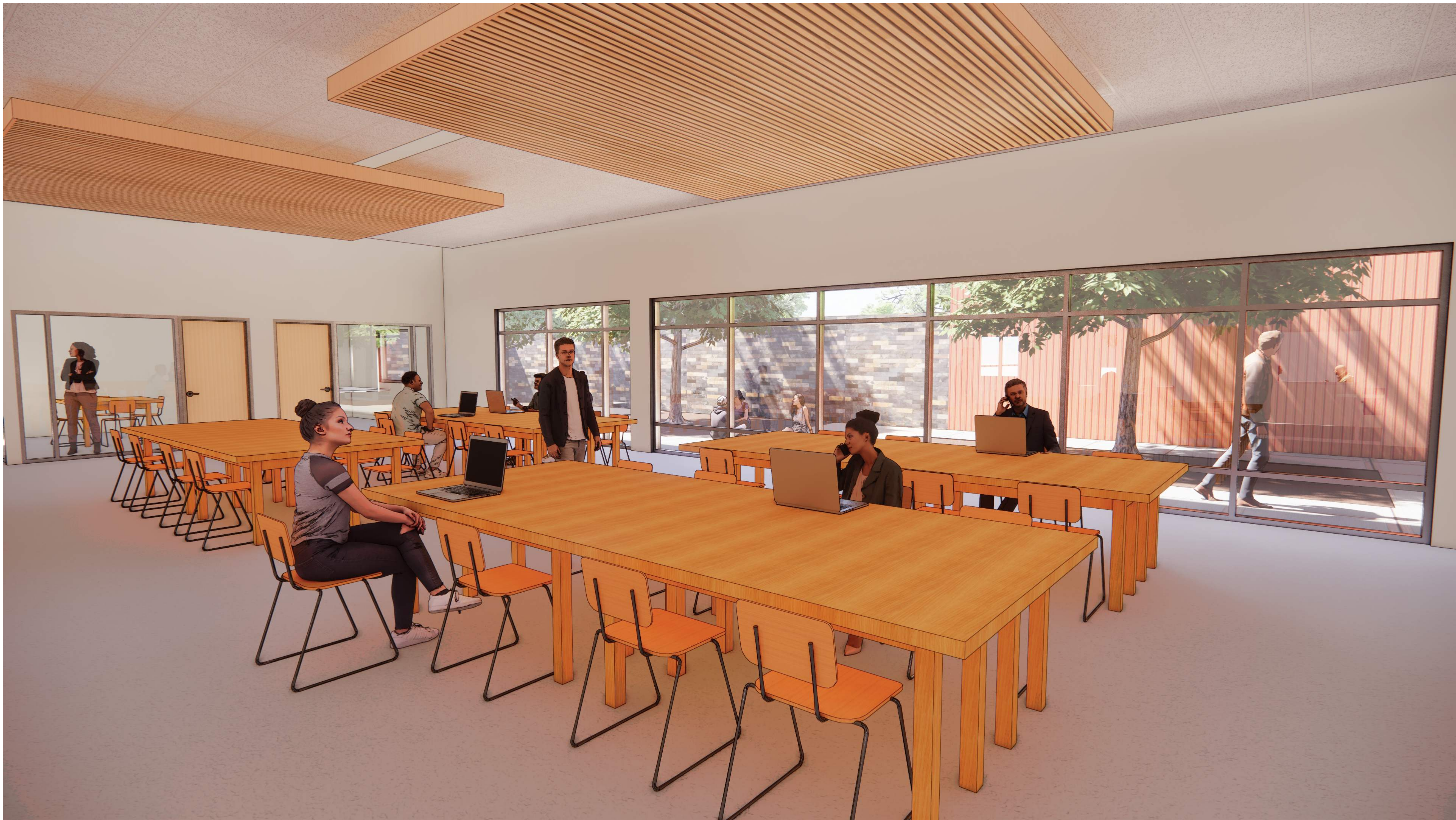
WORKSPACE PERSPECTIVE LOOKING NORTH

CITY OF ALBUQUERQUE COMMUNITY SAFETY FACILITY