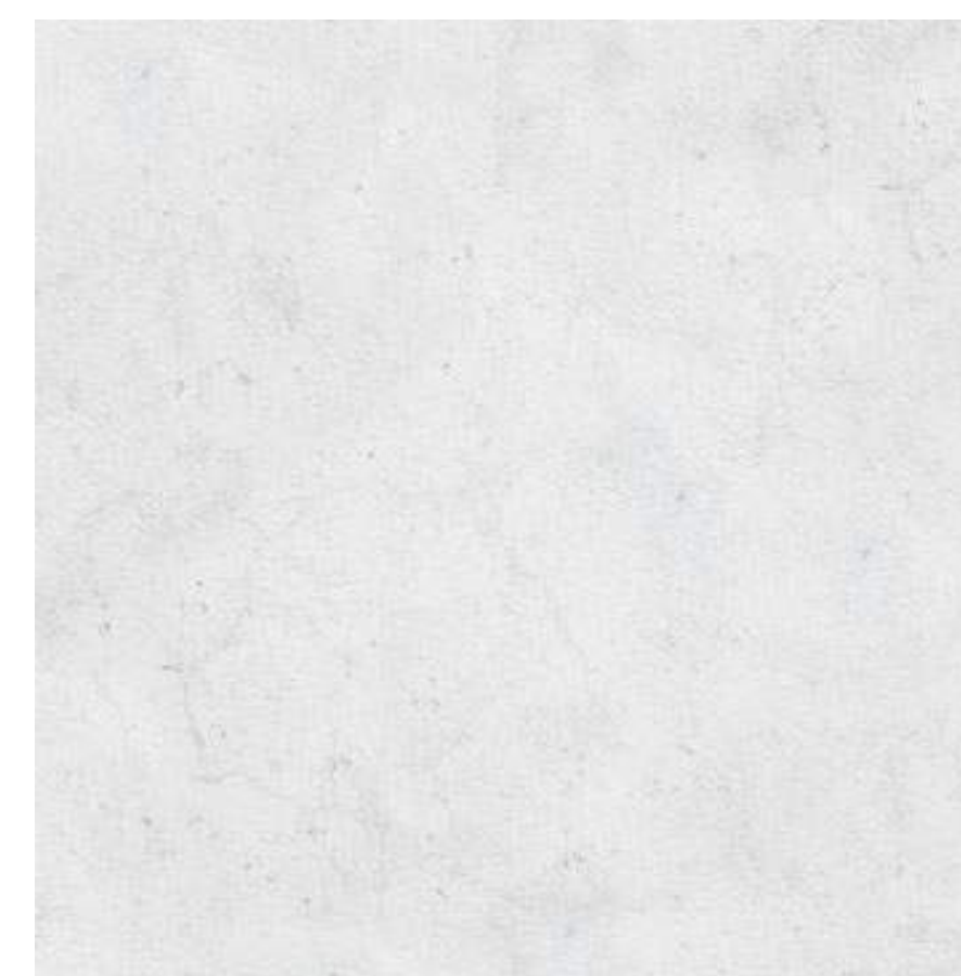
PRIVATE MASS SMOOTH STUCCO