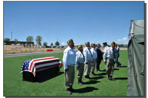
The 2013 Honor Guard Training Conference

The New Mexico Department of Veterans' Services along with the New Mexico Department of Military Affairs are presenting their annual Honor Guard Training Conference on August 22 at the New Mexico Veterans' Memorial in Albuquerque . The conference begins at 8am with presentations and updates about the Honor Guard Program. The conference then moves outdoors for a demonstration and training by The New Mexico National Guard Honor Guard Team, followed by a competition between registered Honor Guard Teams.