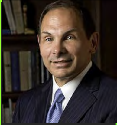
VA Secretary Robert McDonald