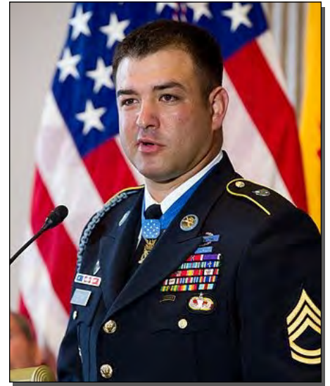
MSG Leroy Petry (USA-Retired)

Sgt. Petry was awarded the Medal of Honor—our nation’s highest combat award—for his heroic actions on the battlefield on May 26, 2008 in Paktia Province, Afghanistan. On that date, then-Staff Sergeant Petry—who was serving his seventh Post-9/11 combat tour-- was credited with saving the lives of his pinned-down fellow Army Rangers by picking up a “live” enemy grenade tossed at his unit’s location. The grenade detonated just as Petry was about to toss it away—resulting in the loss of his right hand and several serious shrapnel-related injuries, but saving his life and those of his nearby fellow soldiers.