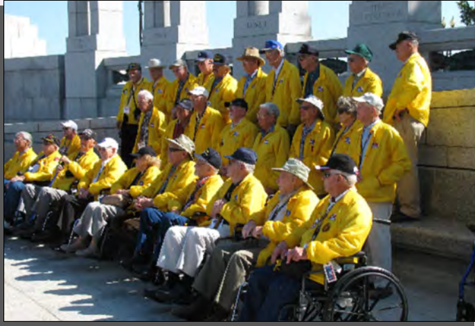
2011 Honor Flight of Southern NM/El Paso Trip

Honor Flight of Southern New Mexico and El Paso is seeking financial donations to help fly 57 southern New Mexico and El Paso-area veterans on its next Honor Flight scheduled for October.