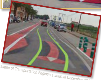
Institute of Transportation Engineers Journal December 2012