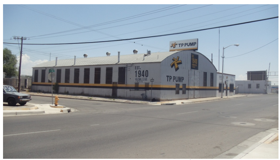
Subtype B: Manufacturing / Repair Shop

Former Eaton Metal Products building, 1824 2<sup>nd</sup> St. NW (1939)