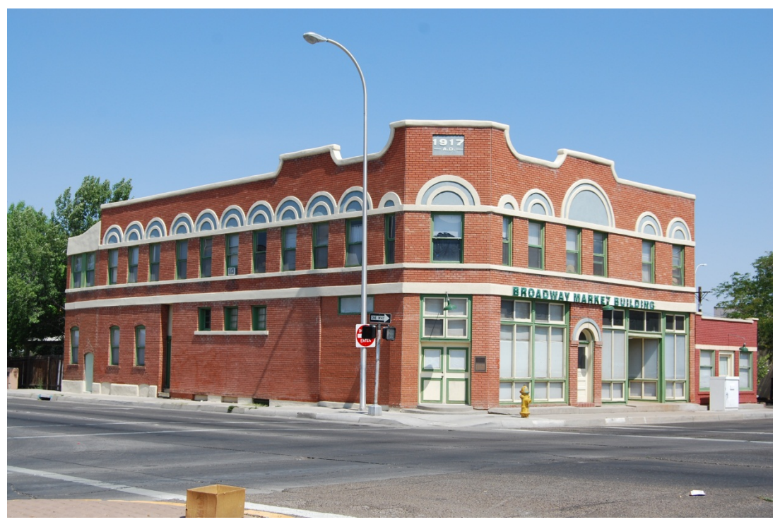
Broadway Market Building, 421 Broadway SE (ca. 1910)