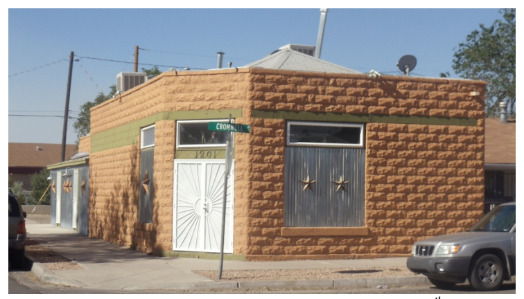
Former neighborhood corner business, South 4<sup>th</sup> St., Barelas