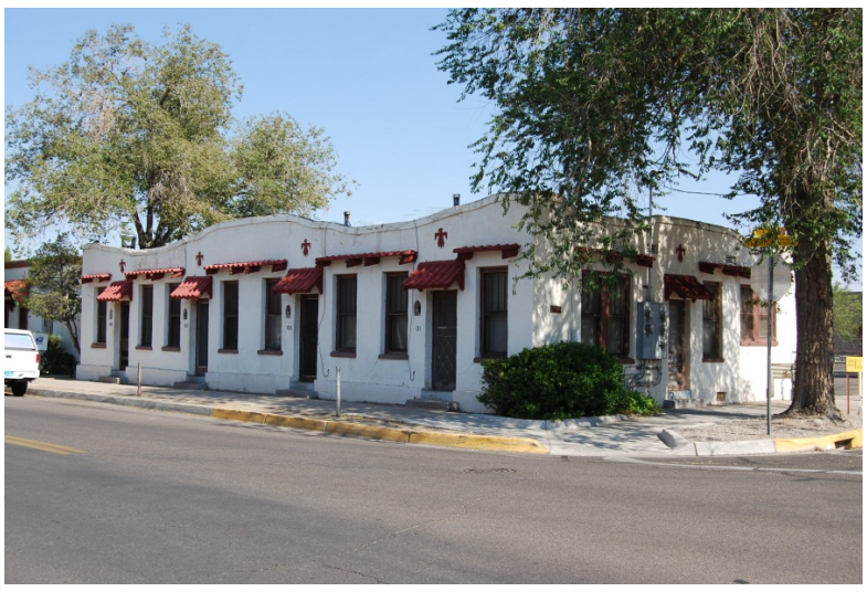
Eller Apartments (1920)