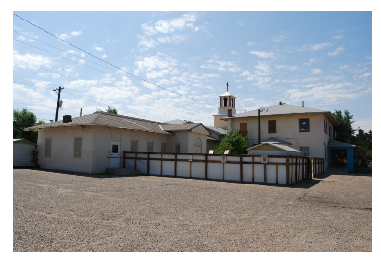
Subtype D: Hospitals