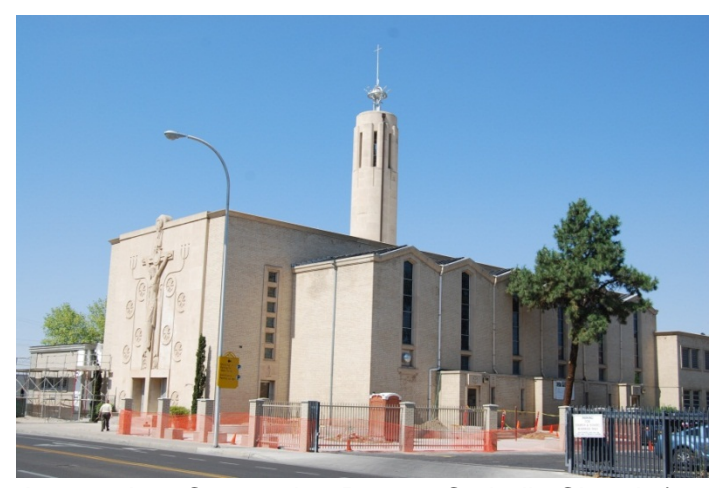
Immaculate Conception Roman Catholic Church (1958)