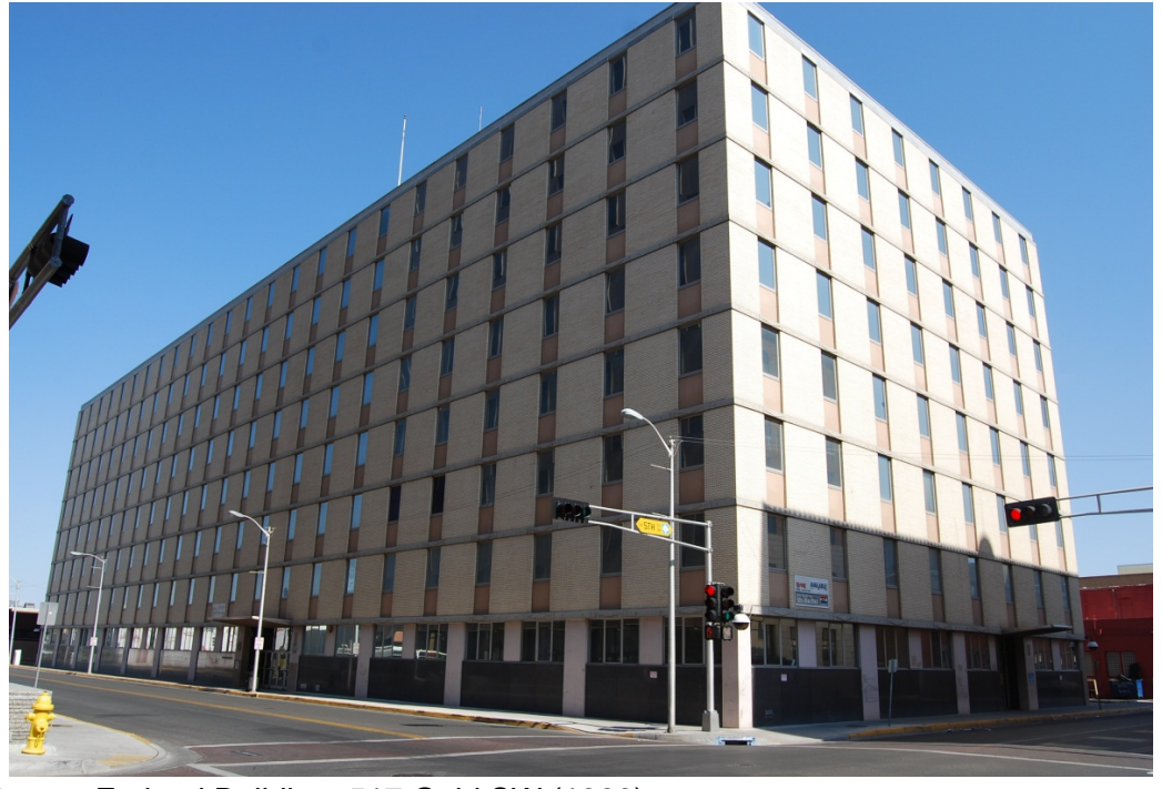
Former Federal Building, 517 Gold SW (1960)