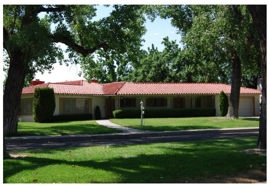
Huning Castle neighborhood (ca. late 1940s-1950s) – Ranch Style (above)