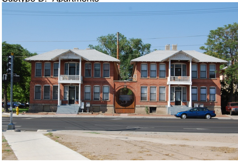
Subtype D: Apartments