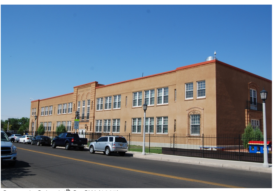
Coronado School 4<sup>th</sup> St. SW (1937)