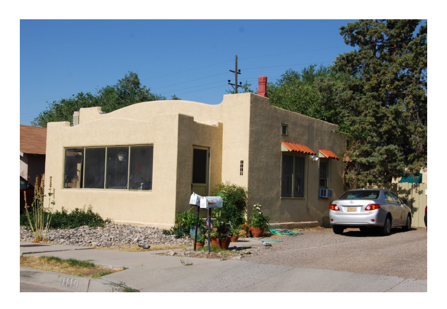
8<sup>th</sup>& Forrester neighborhood – Southwest Vernacular Style