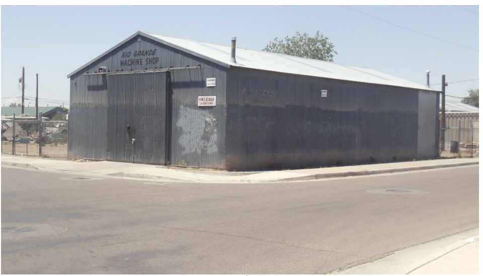
Former Rio Grande Machine Shop, 7<sup>th</sup> and Aspen NW