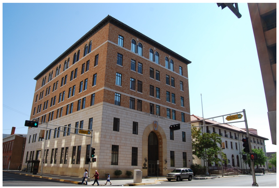
Federal Courthouse (1930) (left) and former U.S. Post Office building (1908)