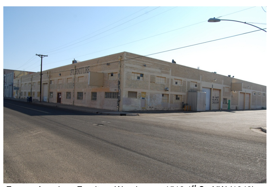
Former American Furniture Warehouse, 1512 1st St. NW (1949)