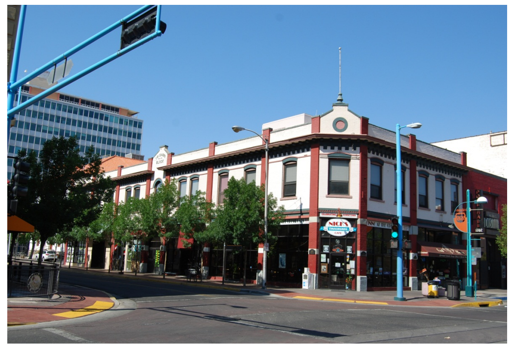
Yrisarri Building, 4<sup>th</sup> and Central SW (ca. 1910)