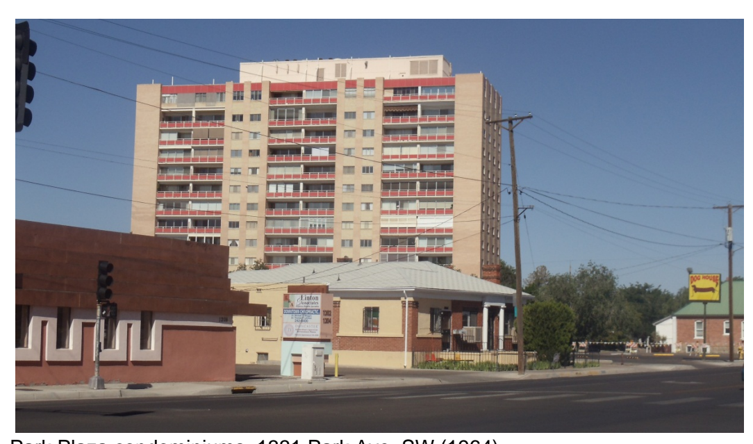
Park Plaza condominiums, 1331 Park Ave. SW (1964)