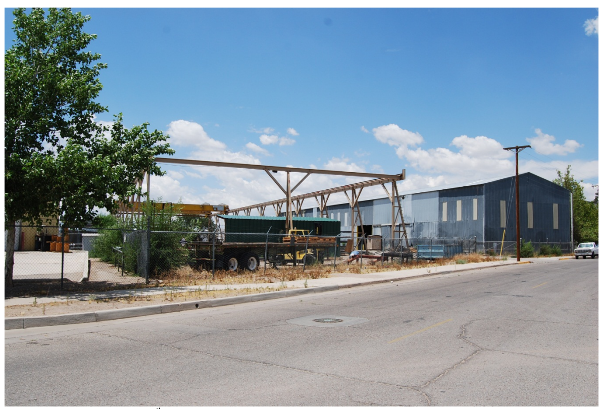
Reliance Steel Co., 8<sup>th</sup> and Aspen NW Note exterior structures associated with building