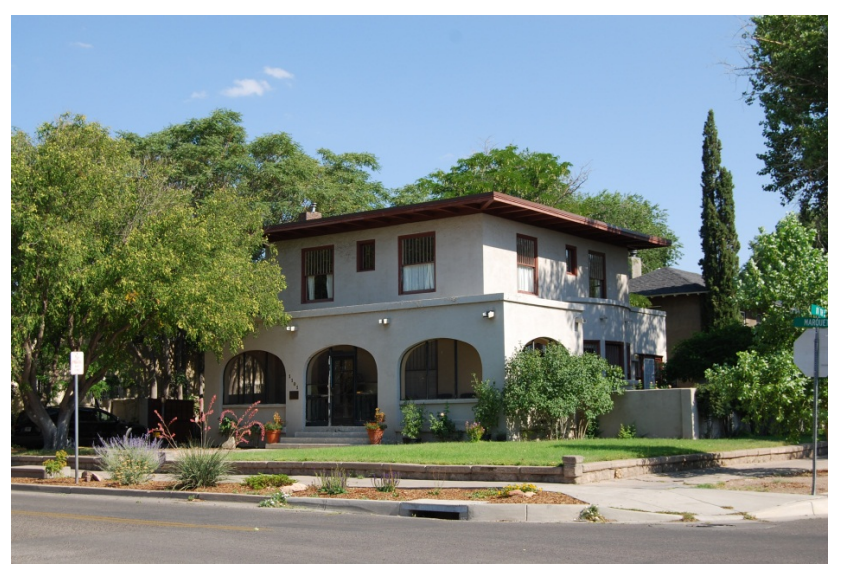
Fourth Ward neighborhood – Prairie (above) and Craftsman styles (below) (ca. 1910s-1920s)