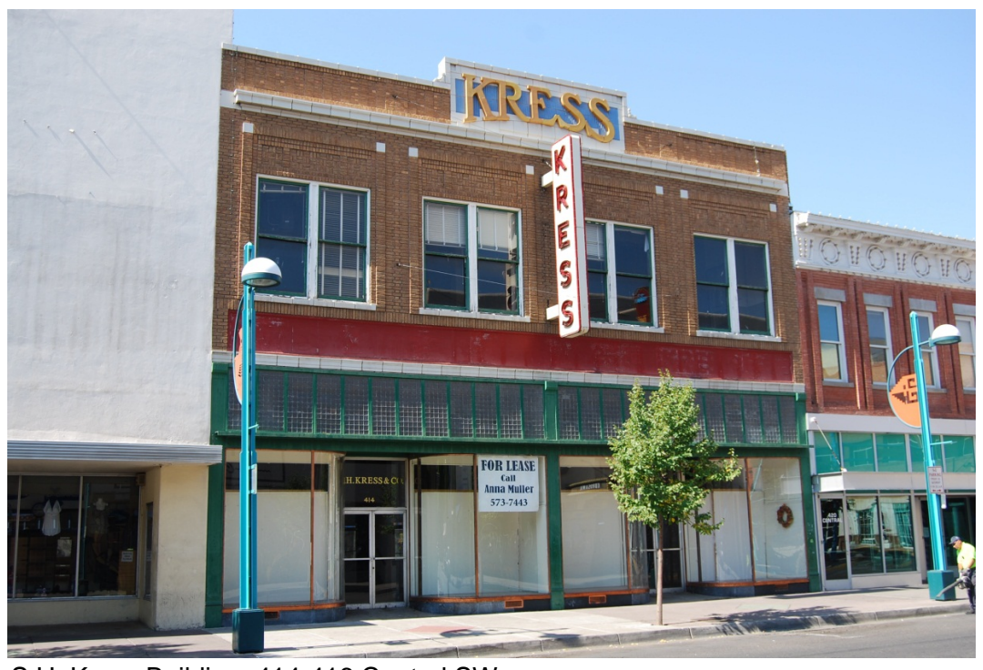
S.H. Kress Building, 414-416 Central SW