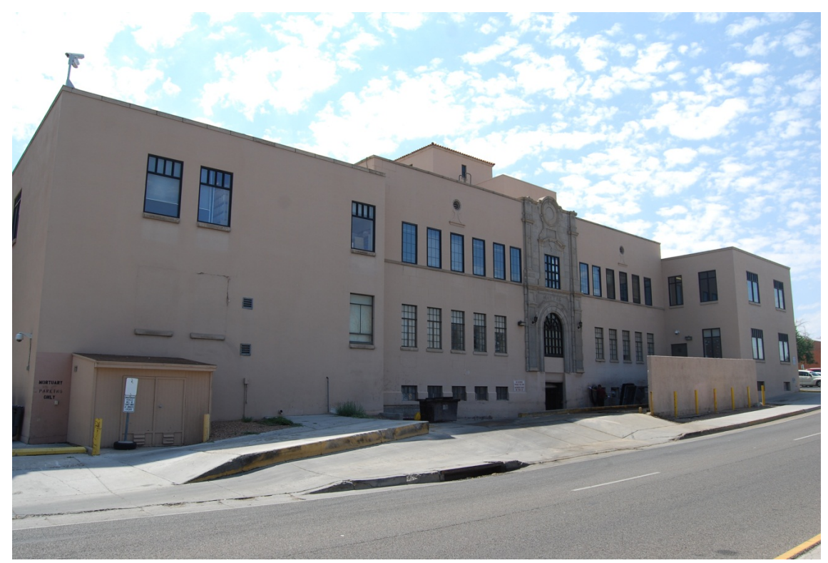
Presbyterian Hospital (Maytag Research Laboratory Building) (1932)