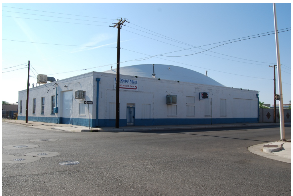
2<sup>nd</sup> and Aspen NW (ca. 1950s)