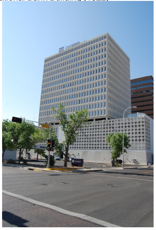
Former National Building (1966)