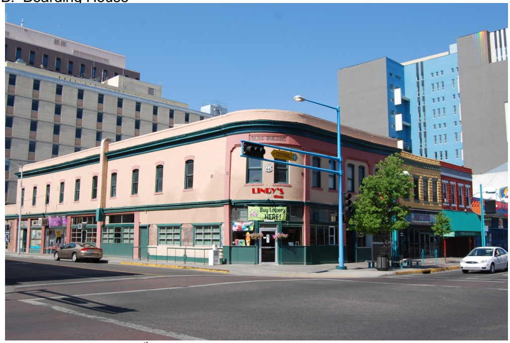
Bliss Building, 5<sup>th</sup> and Central, former Elgin Hotel on second floor (ca. 1910)