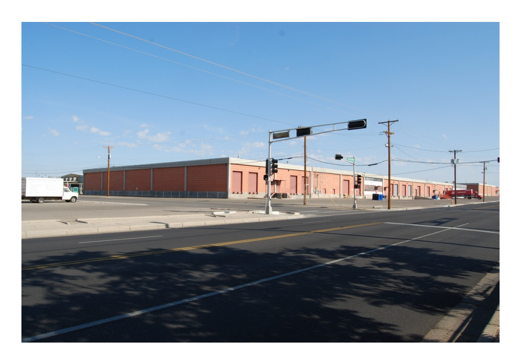
Springer Warehouse Complex, Broadway Ave. NE (ca. 1960)