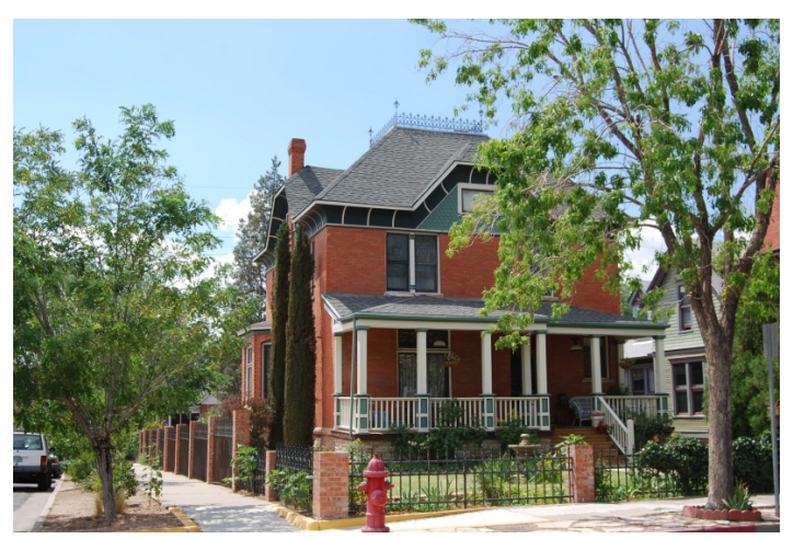
Huning Highlands Addition – Victorian Styles (top and below right) (ca. late 1800s)