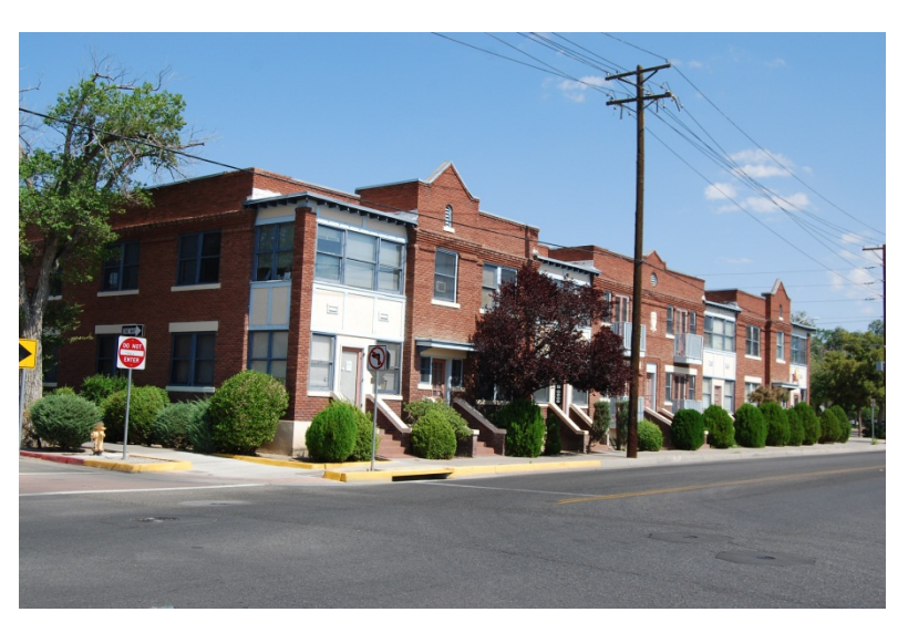
Washington Apartments (1916)