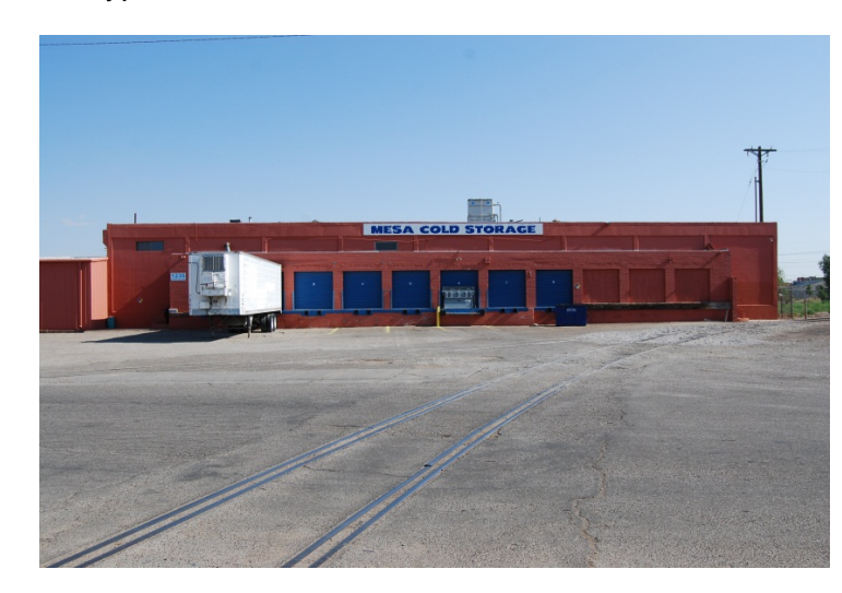
1235 Aspen NW