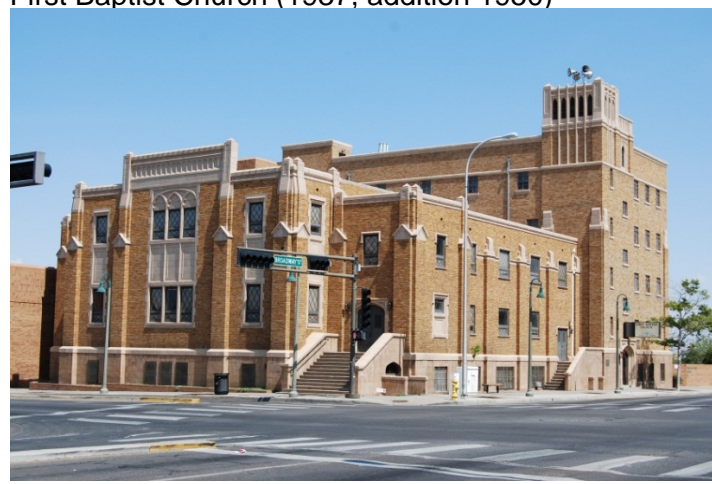
First Baptist Church (1937, addition 1950)