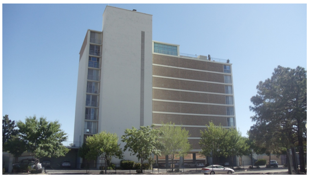
Alcalde Place Apartments, 600 Alcalde Pl. SW (1963)