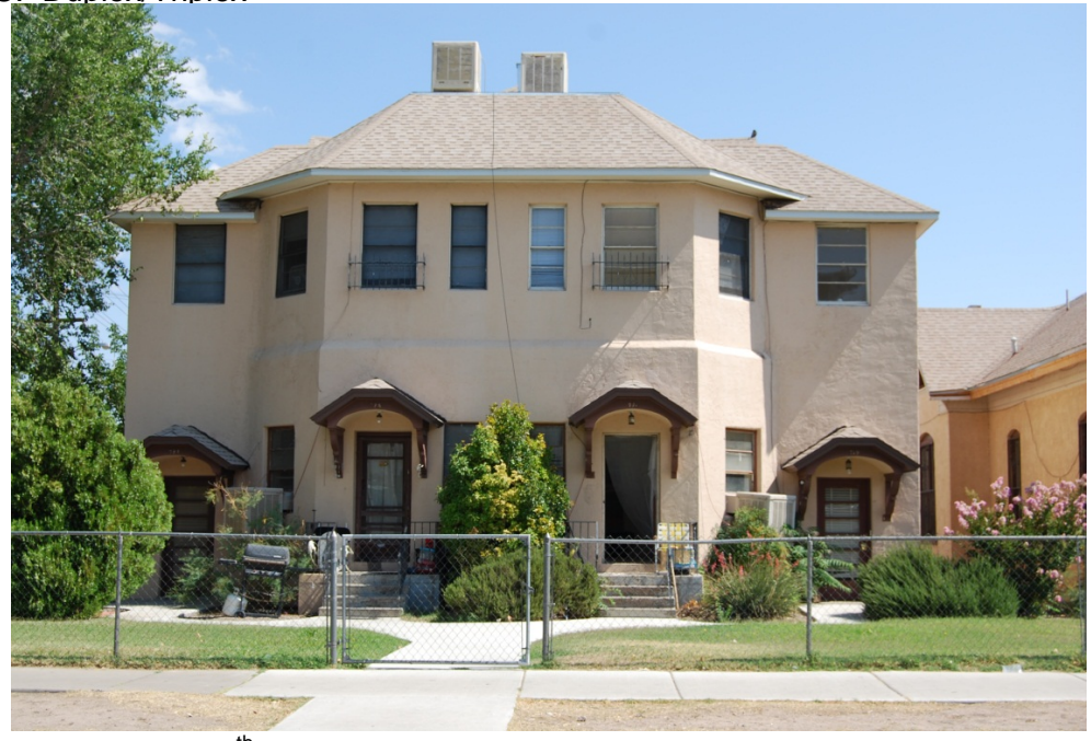
Corner of 8<sup>th</sup> St. and Copper Ave. NW