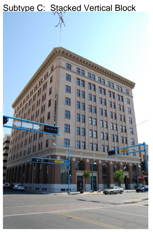
First National Bank Building (1922)