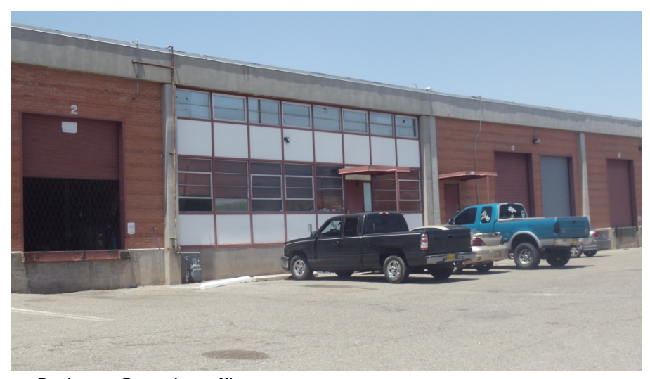
Springer Complex offices