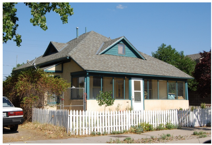
8<sup>th</sup> & Forrester neighborhood – Hipped Box Style (ca. 1910s)