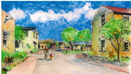
Neighborhood Transition Character Zone

4.2.4. Mixed-Use: The Volcano Heights Mixed Use (SU-2 VHMx) zone is intended to provide the most flexibility of use and development standards surrounding the Regional and Town Centers. VHMx also serves to buffer Transition zones from the auto-oriented uses of the Regional Center and the more intensive urban uses and taller buildings allowed within the Town Center. In addition to general standards in Sections 6-9 , development within the Mixed Use Zone shall meet the Site Development and Building Design Standards in Section 5.4 of this Plan.