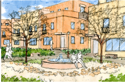
Mixed-Use Character Zone