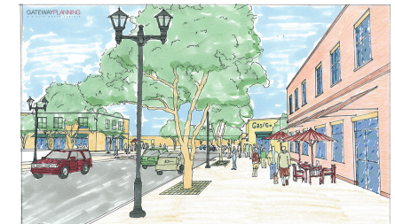
Regional Center Character Zone

4.2.2. Regional Center: The Volcano Heights Regional Center (SU-2/VHRC) zone is intended to provide an appropriate transition into Volcano Heights from the regional, limited-access Paseo del Norte and Unser Boulevard. This area is also intended for large-format and destination retail and office development. In addition to general standards in Sections 6-9 , development within the Regional Center Zone shall meet the Site Development and Building Design Standards in Section 5.2 of this Plan.