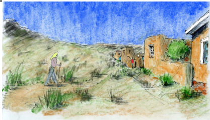
Escarpment Transition Character Zone