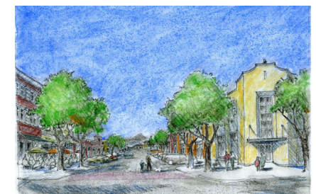
Village Center Character Zone

4.2.3. Village Center: The Volcano Heights Village Center (SU-2/VHVC) zone is intended for smaller-scale, neighborhood-oriented retail and office development with gateway elements at key intersections. In addition to general standards in Sections 6-9 , development within the Village Center Zone shall meet the Site Development and Building Design Standards in Section 5.3 of this Plan.