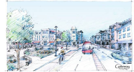
Town Center Character Zone

4.2.1. Town Center: The Volcano Heights Town Center (SU-2/VHTC) zone is intended to implement the City’s vision for an urban center. Development in this zone is intended to create a major employment center with office, entertainment, urban residential, and supporting retail uses. Development can be a mix of employment centers, destination retail, and entertainment, restaurant, and urban residential uses. In addition to general standards in Sections 6-9 , development within the Town Center Zone shall meet the Site Development and Building Design Standards in Section 5.1 of this Plan.