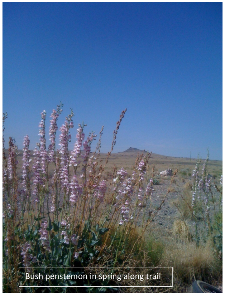
Bush penstemon in spring along trail

For the first 0.6 mile of the Paseo de la Mesa, you are traveling adjacent to a fence, separating the untamed mesa to the south from a housing development to the north. Flowers and desert plants line the trail; in spring the bush penstemon ( Penstemon ambiguous ) puts on a white/pink/purple show; the orange globe mallow in summer and the yellow chamisa in fall also contribute to the beauty of the trail.