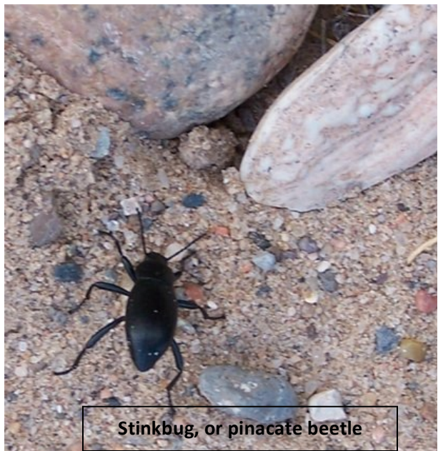
Stinkbug, or pinacate beetle

The 200,000 year old solidified molten rock – basalt – is at every hand. The austere landscape hides many treasures, among them animals – bears, bobcats, cougars, badgers, elk, and antelopes have all been seen here, though it is more likely that you'll see a few birds, a lizard or stinkbug or two, and the ever-present hares and their predators, the coyotes. High desert plants, too, are common. Native Americans sought medicinal herbs in this area; scorpionweed, sand sage, four-wing saltbush and dock were all