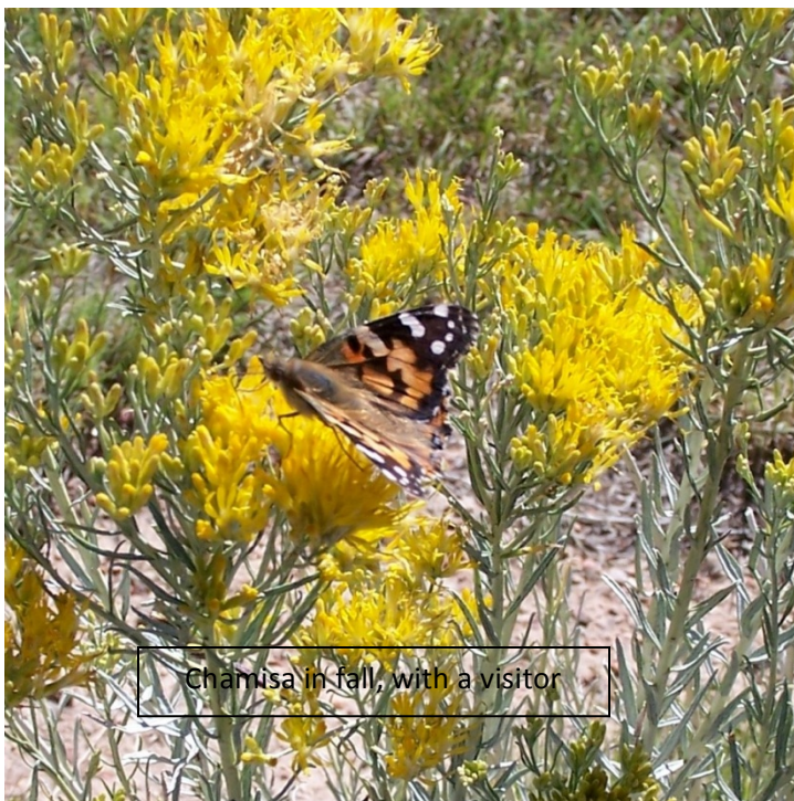
Chamisa in fall, with a visitor

Along much of the trail, occasional pipes and fiber optic cable warnings pop up from among the lava rocks and desert plants. The Double Eagle Airport, which sits just past the end of the trail, needed both water and a fiber optic connection, especially when the airport was to be used to house test flights of the Eclipse Aviation Company. Eclipse was to have been a major economic engine for the always-marginal Albuquerque economy, manufacturing relatively inexpensive private jets (initially to have cost less than $1 million); the economic recession of 2008 eclipsed the company's chances.