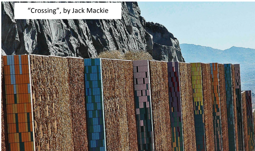
“Crossing”, by Jack Mackie

You can get to the trailhead by road, turning north on Taylor Ranch Road, then west on Montañito and north again on Unser Blvd. Construction of this part of Unser caused a great deal of controversy in the early 2000s; religious leaders from the Rio Grande pueblos were outraged at desecration of Pueblo religious sites