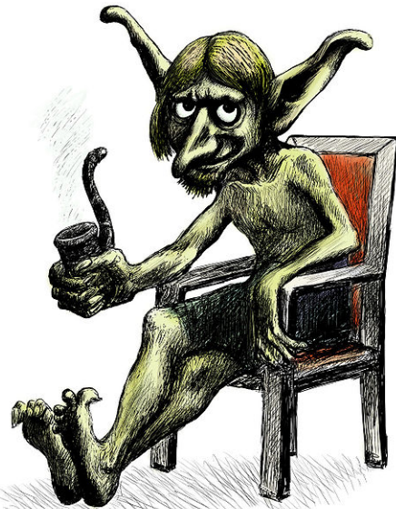
Local guest contributor to your most reliable source of fake Open Space news

In light of an unfortunate pin flag accident which occurred last year while trail planners were working at Las Cebollas Canyon Open Space, the Division put out a Request For Proposals to the film industry for a pin flag safety video. The Division was delighted when director and producer Wes Craven offered to write, direct and produce the safety video for free as a way to thank the Albuquerque community for being such a good host for his recent film, Nightmare on Siberian Elm Street .