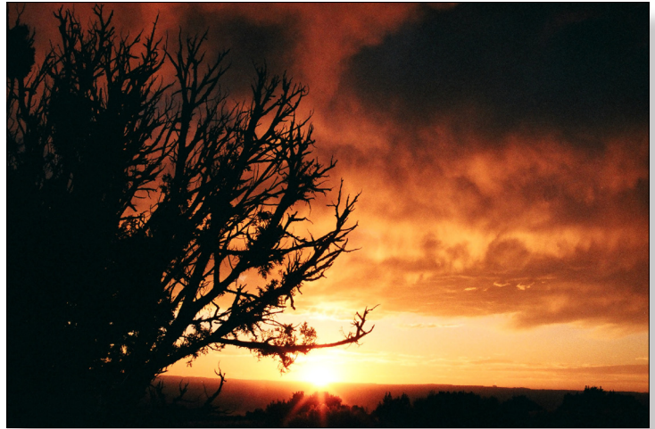
A view at the Sunset Series at Elena Gallegos

It is that time of year again as we gear up for the 2018 Summer Series! Join us Saturday evenings, and listen to a different performer or speaker every week at Elena Gallegos! Or join us Sunday mornings as we explore different Open Space properties.