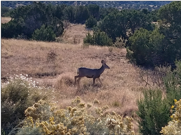
Deer at home in Open Space

bottom photo from a game camera in Open Space