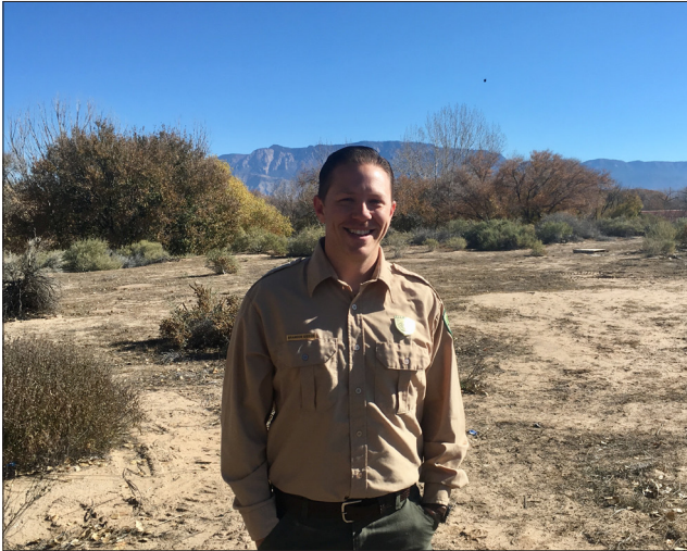
Clean-up day in official uniform