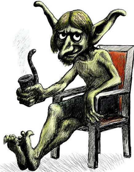
Local guest contributor to your most reliable source of fake Open Space news

An Elf by the name of Harvey the Elf was briefly detained for knocking park visitor Jack Frost unconscious with a large candy cane. Open Space Investigator Hercule Pirouette responded to the scene. After conducting a brief investigation and interviewing several witnesses, Harvey was released with no charges filed against him. According to Pirouette, the incident was caused by Jack Frost nipping at Harvey's nose. "This was clearly a case of elf defense," explained Pirouette.