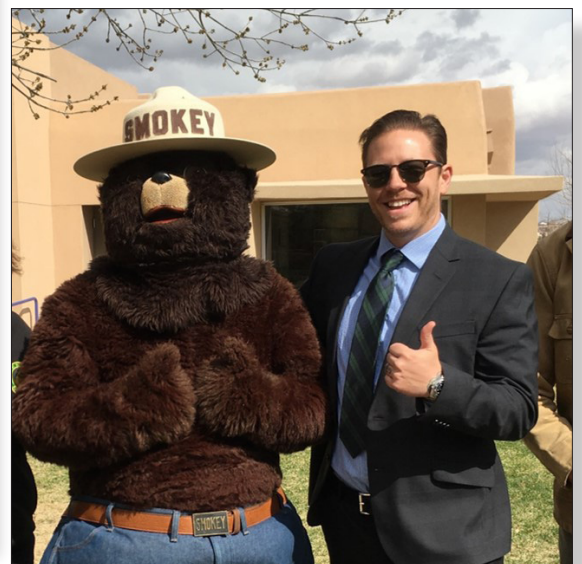
With our pal Smokey Bear