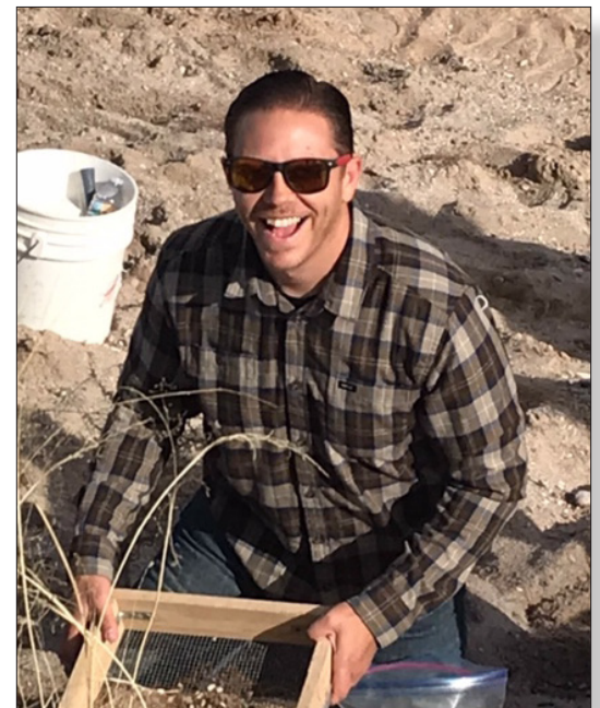
Learning the tricks of the paleontology trade