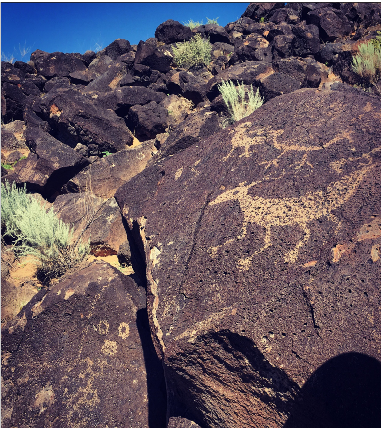
Petroglyph concentration at Petroglyph National Monument

The Open Space Division, as co-owners and co-managers of the monument, have been pleased to collaborate with monument staff throughout the process and look forward to cultivating our partnership through future projects.