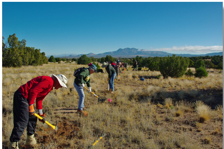
Volunteers construct a trail in Golden Open Space, October 2015

New Mexico Magazine recently highlighted Open Space lands in an article titled "Albuquerque, Naturally," in its July edition. According to the author, "When it comes to places to luxuriate in fresh air and nature in an urban environment, the Duke City is hard to beat." She offers her take on the Best Hiking Hot Spot (Golden Open Space) and Best Walking-Distance Waterfall (Piedra Lisa), among others. Visit the website at www.nmmagazine.com to read the full article.