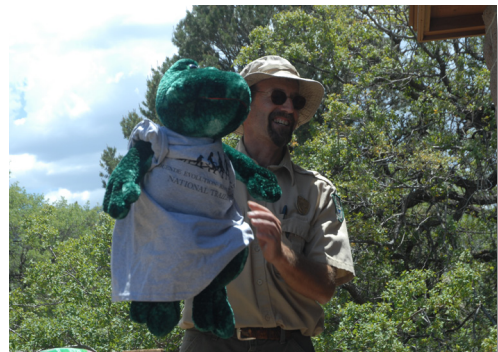
National Trails Day prize for hardest-working duendecita