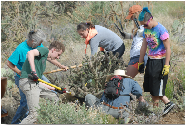
Volunteers at Piedra Lisa Spring Cleanup

From March through early June almost 400 volunteers participated in stewardship projects on Open Space properties. These projects included National Trails Day, National River Cleanup and Spring Cleanup and trail maintenance days in the Sandia foothills (Route 66, Copper, Menaul, Indian School, and Piedra Lisa areas). Participation varied from 31 volunteers at Route 66 to 110 at the National River Cleanup. Here are some of the highlights!