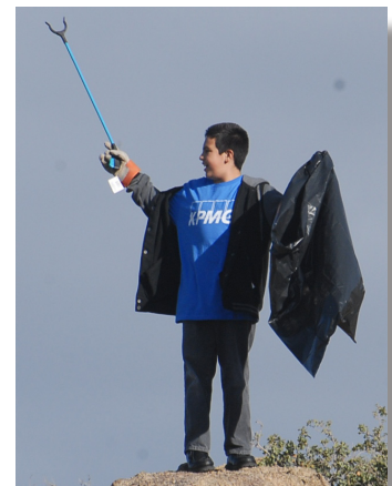
A triumphant volunteer at last year's Make A Difference Day

Volunteers should register with the Center for Nonprofit Excellence at www.centerforprofitexcellence.org/volunteer-connection . For more information please call 452-5200 or email jsattler@cabq.gov .