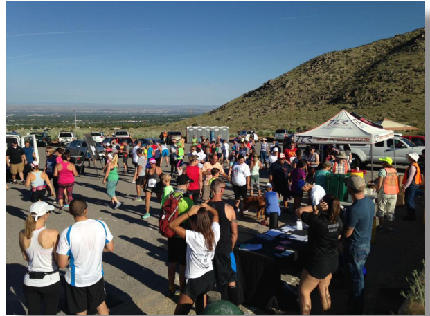
Runners at Embudo Canyon

The non-profit Open Space Alliance (OSA) partnered with TCR Productions to host its first ever fundraising event, the foot race known as Run for the Hills, held August 21 on Embudo Canyon Open Space trails. Over 50 volunteers helped on race day, arriving as early as 5:30am to help with all aspects of the race. Not only did we have fantastic volunteers, but The North Face was our title sponsor, providing their store location for packet pickup along with some great swag and a cash donation. Nearly 200 runners competed in the chip-timed event, which featured 10K and 5K competitive trail runs and a 1K fun run for kids. OSA is delighted to report that not only did the event break even, but we cleared over $650! These funds will directly support Open Space Division projects, events and facility improvement initiatives. Thank you to Open Space staff for input and support regarding the event permitting and promotion. Planning has already started for next year's Run for the Hills. We will use our rookie experience to make the 2017 race bigger and better! Assistance is needed in all aspects of planning – please contact current board president Steve Glass if you are interested.