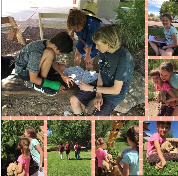
Explorer Pack activities at the Visitor Center

Children and children at heart are encouraged to stop by the Open Space Visitor Center to check out an Open Space Explorer Pack and experience all the natural wonders we have to offer. The Open Space Division and REI are sponsoring the Explorer Pack project, which is intended to get families outside