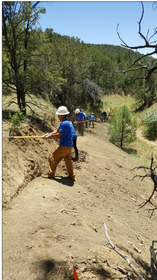
Rocky Mountain Youth Corps crew building the new trail at Milne Open Space

Lisa Canyon in the Sandia Foothills, and Boca Negra Canyon in the Petroglyph National Monument. This has been a beneficial program for all involved and we celebrate the accomplishments that these hard working youth crews have achieved.