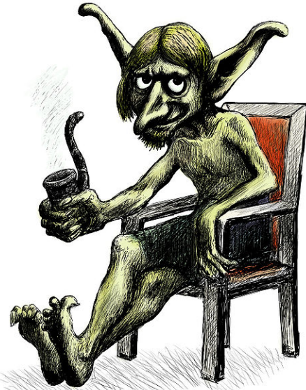
Local guest contributor to your most reliable source of fake Open Space news