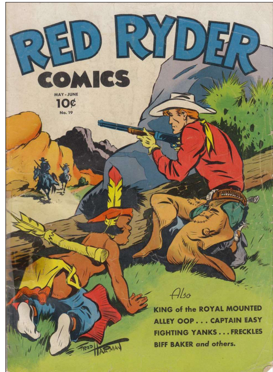
Red Ryder Comics #19 Dell Comics/Western Publishing; May 1944 Pencils by Fred Harman