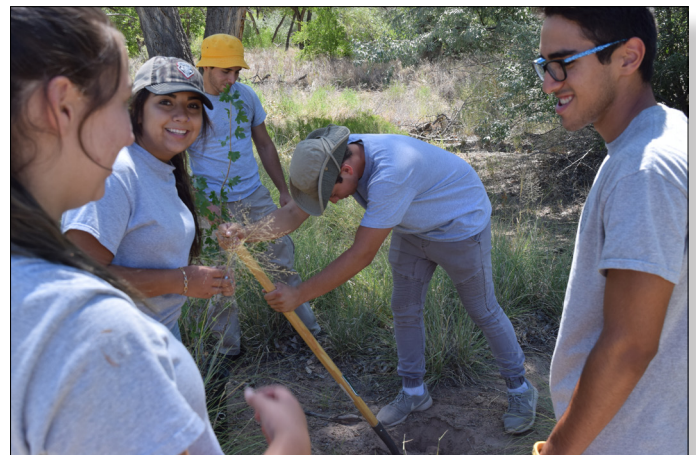
Bosque Youth Summer Corps workers planting trees

Seventeen crew members and three crew leaders worked for ten weeks out of their summer as part of Mayor Berry's Bosque Youth Summer Corps. The Bosque Corps helped to beautify the bosque by removing hundreds of feet of obsolete barbed-wire fencing, planting hundreds of native bosque shrubs, and installing informational signage for visitors to view, amongst completing many other restoration related projects. This year the bulk of the work was performed in the area from Campbell Road north to Montañó Boulevard along the newly constructed ADA accessible, Rio del Norte Trail. The Bosque Corps also participated in a career mentorship component this year, in which professionals from local, state, federal, and non-governmental entities spoke about their respective career fields. Topics ranged from the history of flood control measures in the Rio Grande Valley, to native versus non-native invasive plants in the bosque , to participating in an urban park tree inventory case study with New Mexico State Forestry. Mayor Berry stated, "We are cultivating the next generation of stewards to protect and preserve the land for many years to come." This is the third consecutive summer the Bosque Youth Summer Program occurred, creating paying jobs for young men and women willing to take a role of leadership for the summer.