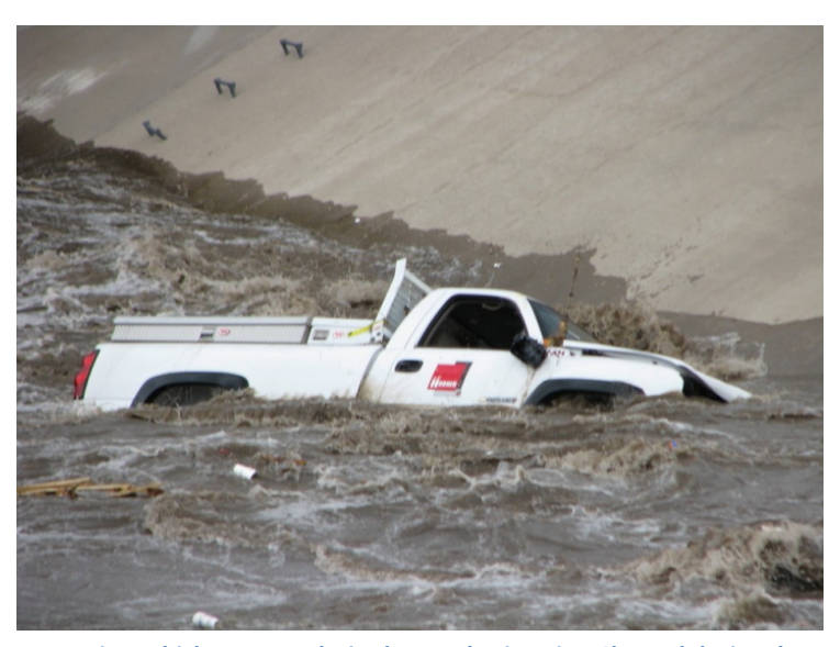
A service vehicle was caught in the North Diversion Channel during the flood of 2013

This is the end of the tour., though if you could see it past the berm along the North Diversion Channel and Interstate-25, you might see the depression of the Hahn Arroyo leading down the hill to Hahn, near the tracks.